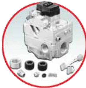
720-079 Universal Electronic Ignition Gas Valve