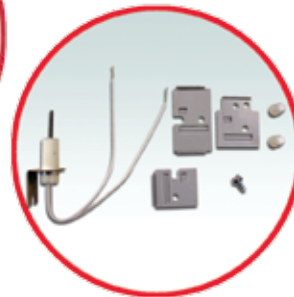
41-802N Universal Ignitor