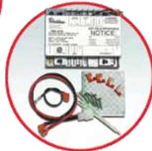
780-910 Universal Hot Surface Ignition Control