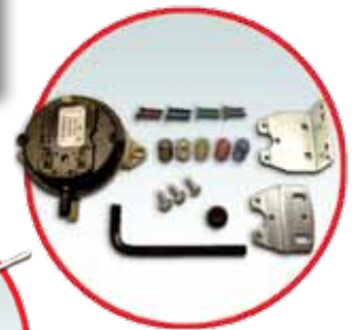
2374-510 Universal Air Pressure Sensing Switch