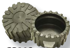
GB20S 2" Gauge Boot Set, (2) Black