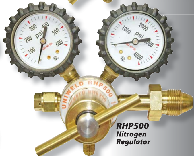
RHP500 Nitrogen Regulator

F36 (UPC# 43319) Nitrogen to CO 2 adaptor