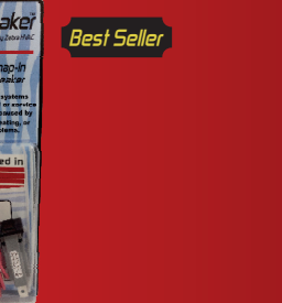
ZK005 5 Amp Circuit Breaker