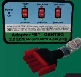
<u>UZHMB</u> Best Seller Fits GENTEQ 3.0 ECM motors 4-pin plug