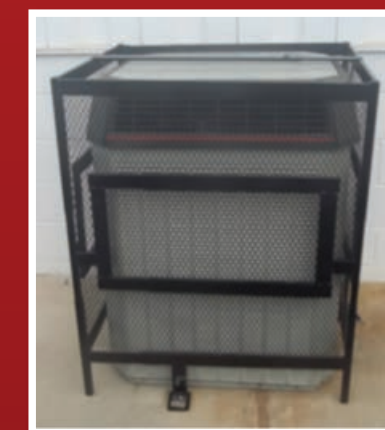
MACGU Kit - Mega Kit w/optional Expanded Metal

Your unit is wider than 51"? NO PROBLEM! Just purchase two cages and mount side by side!