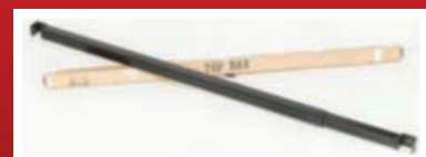
ACB – Extra Security Bar

Optional AC-Guard Locks come w/magnetic hide-a-key box. Special Bolt-cutter proof design. Set of 3 included with purchase of ACGU KIT