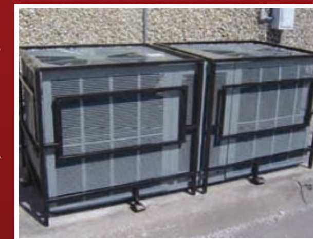
Two ACGU Units with locks

Your unit is wider than 51"? NO PROBLEM! Just purchase two cages and mount side by side!