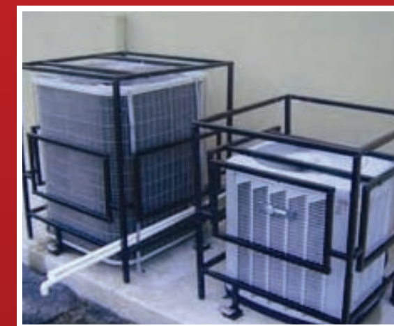
2 ACGU KITS w/extra bar (ACB)