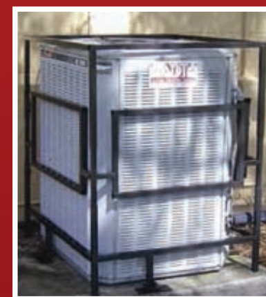
ACGU - Original AC-Guard Unit