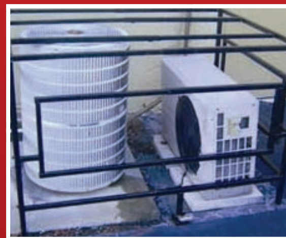
ACGU KIT w/extra bar (ACB) on top