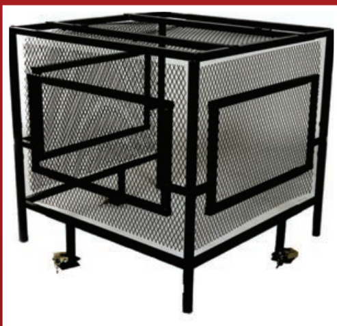
MACGU – 2" flat steel framework w/optional expanded metal