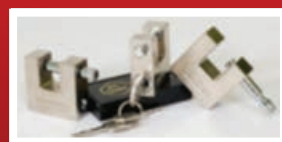
ACL – AC-Guard Locks

Optional AC-Guard Locks come w/magnetic hide-a-key box. Special Bolt-cutter proof design. Set of 3 included with purchase of ACGU KIT