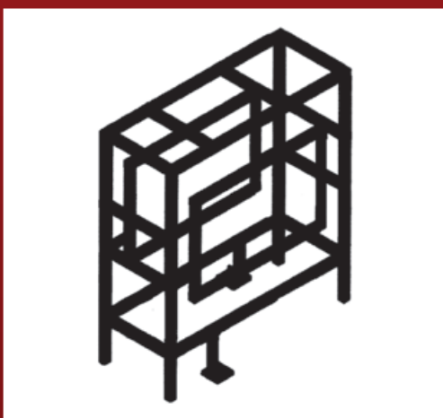
ACMS KIT – 1" steel framework