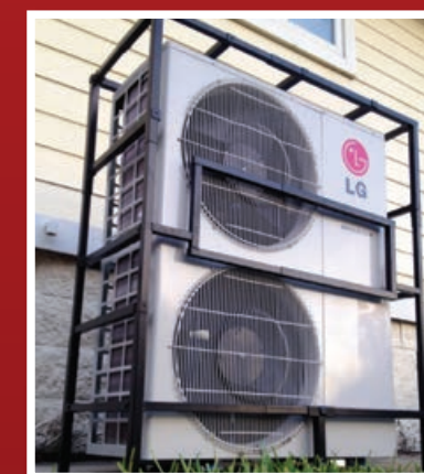
ACMS - Mini-Split Security Kit