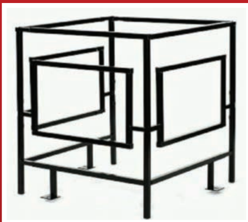
ACGU – 1" steel framework