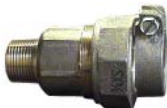
AA LEAD X MIPS PACK-JOINT ADAPTER - LEAD FREE -

- Copper tube size equivalents of these couplings are listed in the above table. Sizes over 3/4" IPS do not have reliable copper tube size equivalents. - 125 psi at 180° - Imported