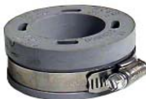
RUBBER WASHING MACHINE HOSE GRIPS

- Drain and trap connections are 12 per box, with a one piece minimum.