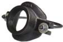
CAST IRON TAPPED SADDLE TEE