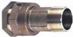
WATER METER COUPLINGS WITH WASHER - LEAD FREE -