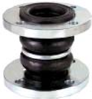
TWIN-SPHERE 150# EXPANSION JOINT