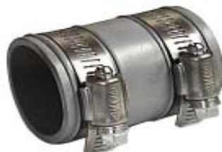
RUBBER DRAIN AND TRAP CONNECTION