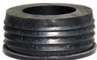
RUBBER TRANSITION DONUTS

- Sizes listed are for Schedule 40 Steel, Cast Iron, and PVC