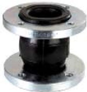
SINGLE-SPHERE 150# EXPANSION JOINT