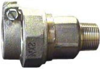
COPPER X MIPS PACK-JOINT ADAPTER - LEAD FREE -