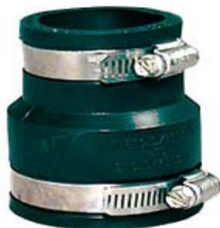
RUBBER TRANSITION COUPLINGS