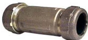
W-R BRASS COMPRESSION COUPLINGS - LEAD FREE -