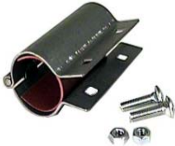
WAL-RICH HINGED STEEL PIPE CLAMP