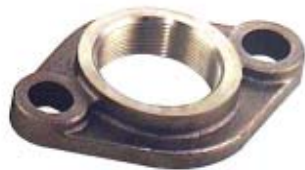
BRASS WATER METER FLANGE SET - LEAD FREE -