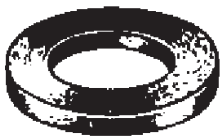
WATER METER COUPLING WASHERS