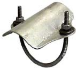
STEEL REPAIR PLATES