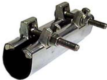
STAINLESS STEEL WRAP-AROUND REPAIR CLAMPS