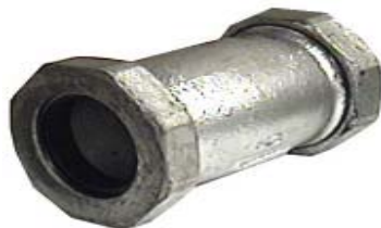
W-R GALVANIZED MALLEABLE IRON COMPRESSION COUPLING