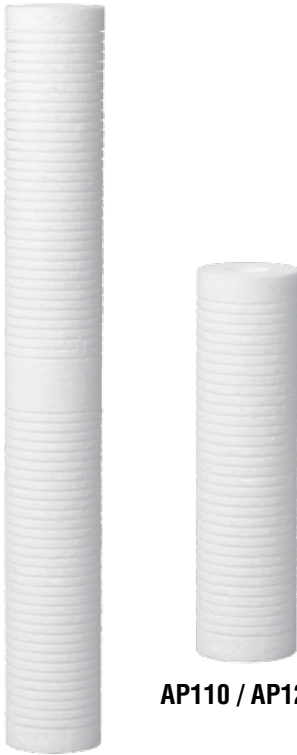
AP110 / AP124