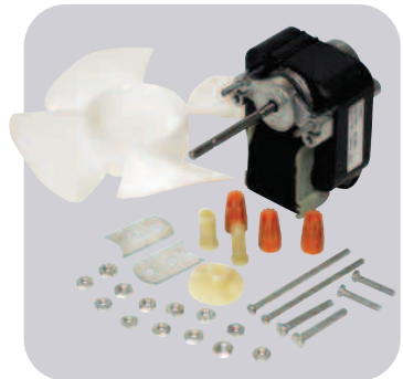
MARS 90970 Replaces: