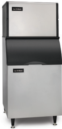
ICE0500 ON B55

Ice-O-Matic modular cubers are designed to provide the highest reliability, with carefree operation and maintenance. They produce pure, crystal clear ice for the most demanding foodservice and hospitality needs. They are also perfect on a storage bin or beverage dispenser. Full, grande and half cube configurations are available.