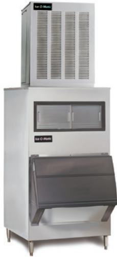
GEM0650 ON B700-30 BIN

Our GEM Series modular machines make nugget ice the highly desired soft chewable ice that consumers love. They feature the benefits of decreased water and power usage compared to cube ice makers. Additionally, the stainless steel exterior construction, industry-leading in-line direct-drive technology and SystemSafe monitoring technology help reduce costly breakdowns.