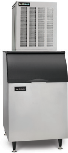
MFI1256 ON B55

MFI Series modular flake ice machines feature the benefits of our SystemSafe load-monitoring control board that continually checks the workload on the gearbox. Additionally, the durable stainless steel evaporator, auger and in-line direct-drive train help reduce breakdowns.