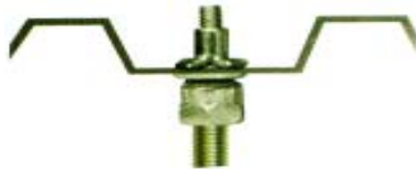
Sammy XPress #2440030