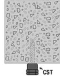
Use 20 ft/lbs torque on nut. For CST use 1/4" bit & drill 2" deep in concrete.