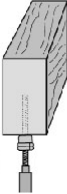
Straight Screws For 3/8" All-thrd rod Min. 1/4" Steel Min 1-1/2" Wood