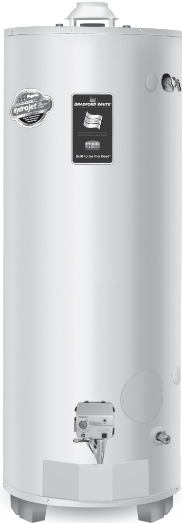
Photo is of RG2100H6N