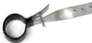
PVC-COATED DWV HANGERS