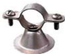
COPPERIZED BELL HANGERS