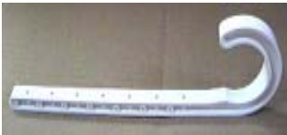
WHITE ABS J-HOOKS