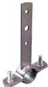
COPPERIZED MILFORD HANGERS