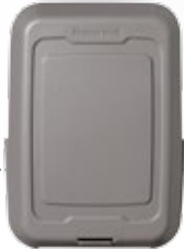
Wireless Outdoor Air Sensor