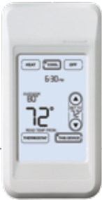
Portable Comfort Control™

Property managers can remotely monitor and control their heating and cooling systems anytime, anywhere. Free apps are available for both Apple® and Android™ devices.