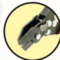
HN1V Hand Notcher

Join corrugated round or square sheet metal pipes of same size with ease. Crimpers work on up to 22 gauge sheet metal. Notcher produces a clean 30° V-shaped cut in sheet metal without slippage.