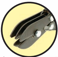
HC5V Five Blade Hand Crimper