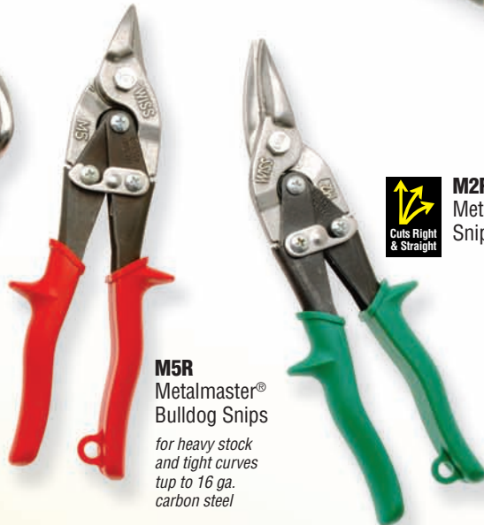
M5R Metalmaster® Bulldog Snips for heavy stock and tight curves up to 16 ga. carbon steel