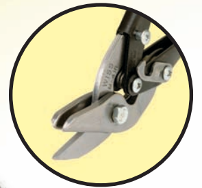
M41R 9 1/4" Metalmaster Pipe & Duct Snips

Hand Seamers feature 1/4" incremental depth marks on jaws. Pipe and duct snips use a patented ball-bearing jaw action that automatically adjusts blade clearance. Choose the HM41V for rigid non-metallic sheet materials or the M41R for sheet metal, vinyl tiles and plastic laminates.