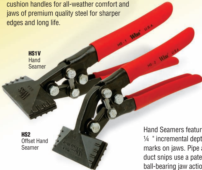
HS1V Hand Seamer

Wiss HVAC tools feature rust resistant blades and compound action jaws for easy metal bending, cutting, and flattening. All have cushion handles for all-weather comfort and jaws of premium quality steel for sharper edges and long life.