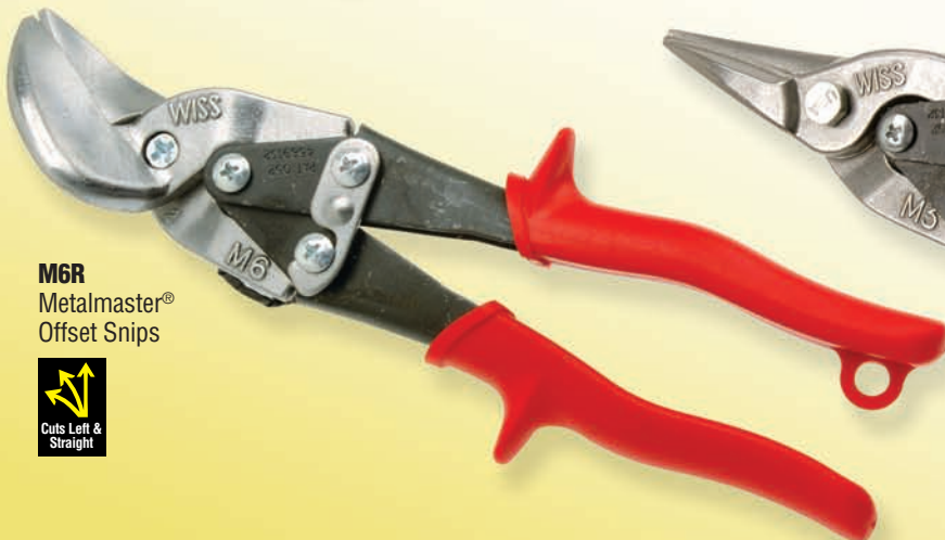
M6R Metalmaster® Offset Snips