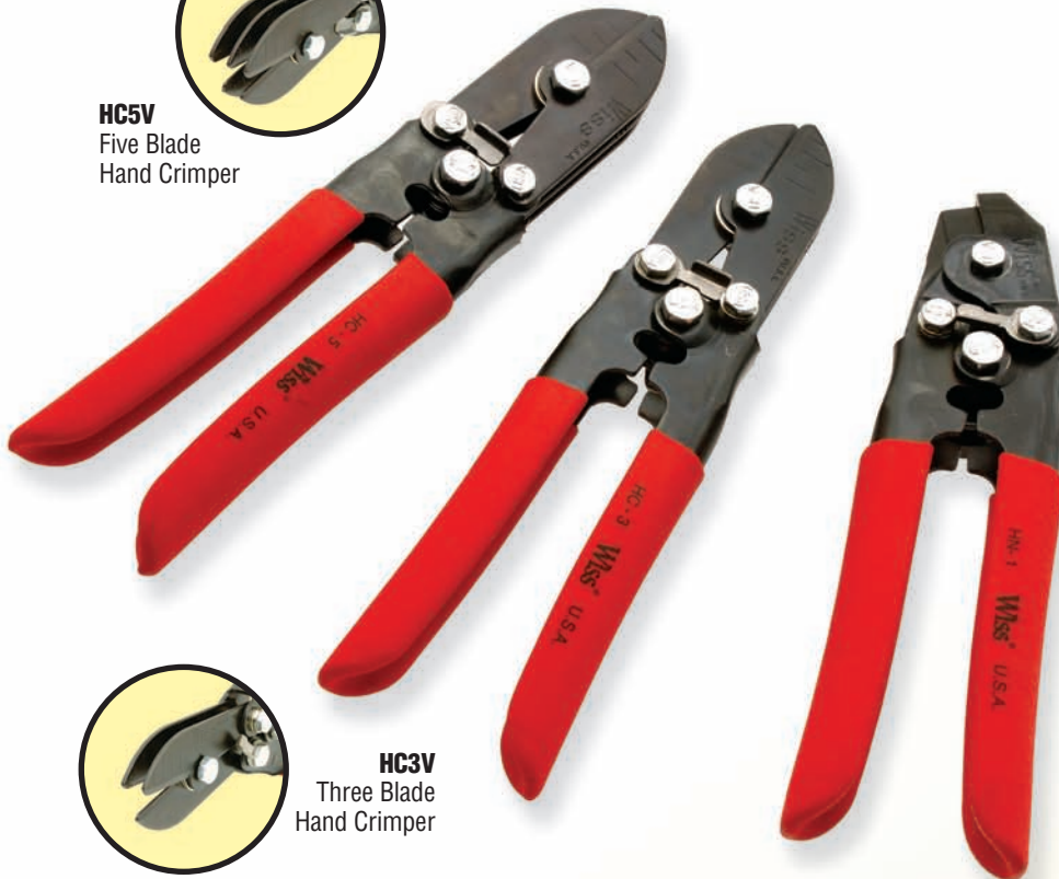
HC3V Three Blade Hand Crimper