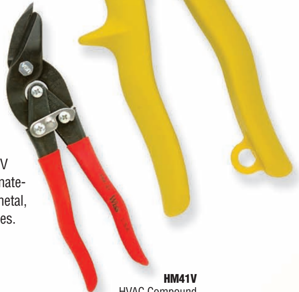
HM41V HVAC Compound Action Pipe & Duct Snips