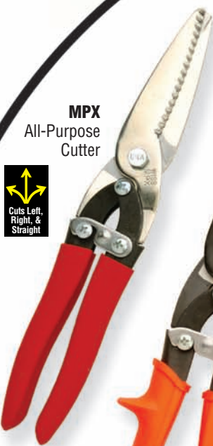
MPX All-Purpose Cutter

The MPX All-purpose Cutter has 3-inch chrome-plated blades to resist rust and corrosion, with grips designed for smaller hands. The M300 MultiMaster® snips combine the long cut of traditional tinner's snips with the power of compound action, making them perfect for long, fast cuts in materials like paper, plastic, and sheet metal. MPC3 Metal Wizz® snips are made for around-the-home use, cutting materials like screening, shingles, carpeting, and many more with ease.