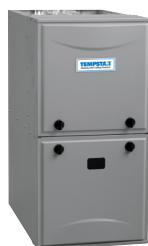
Ion Series Gas Furnaces