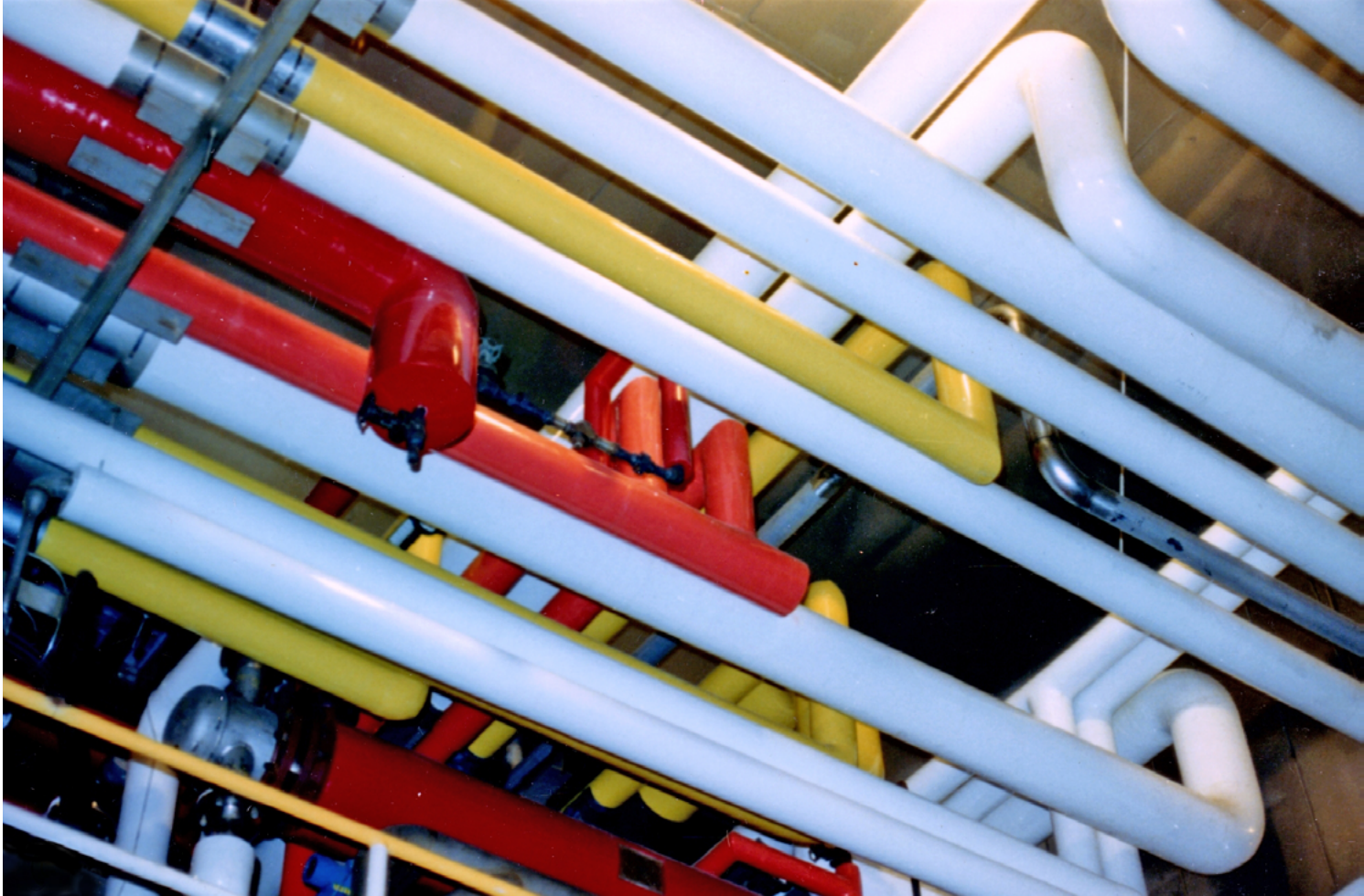
Aerocel® with SaniGuard™ available in white only