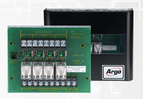
AD-1/4 ARM Control Expansion Module*