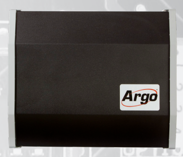
EZ1/3 Universal Control Expansion Module*