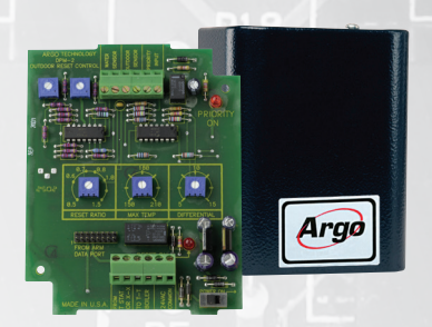
DPM-2 Outdoor Reset Control