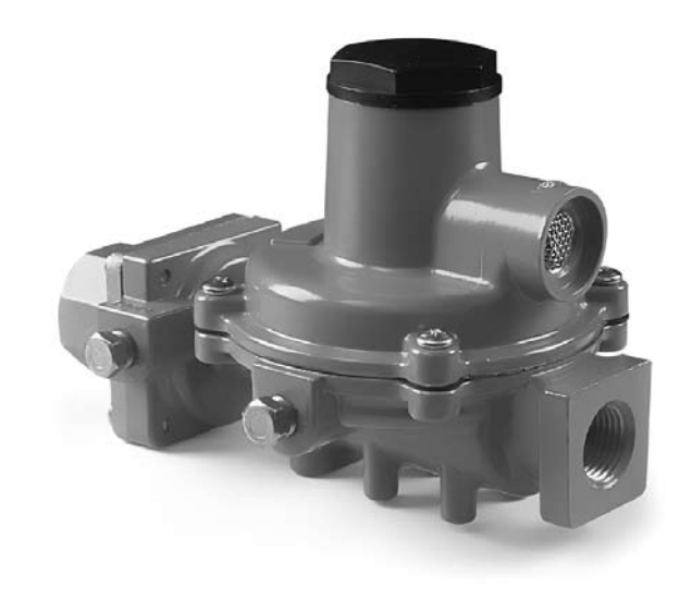
Figure 1. Type R232 Integral Two-Stage Regulator