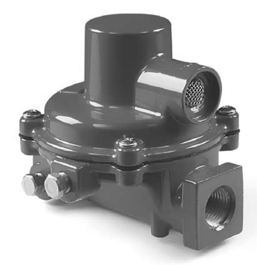
Figure 1. Type R122H First-Stage Regulator