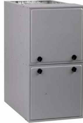
Illustrations and photographs are only representative. Some product models may vary.