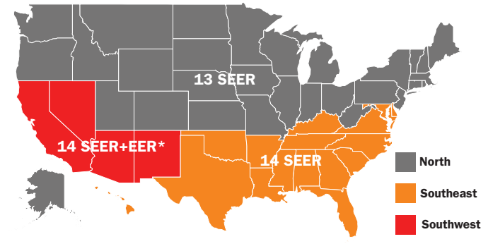
On January 1, 2015, a new set of minimum efficiency standards took effect. Under the new standards, there are different efficiency minimums for air conditioners in each of three regions—North, Southeast and Southwest. The national minimum efficiency standard for heat pumps is 14 SEER/8.2 HSPF.

*12.2 EER<45.000 Btu/h, 11.7 EER≥45.000 Btu/h