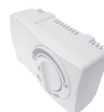
MXH3C Manual Humidistat GFI #7038 Included