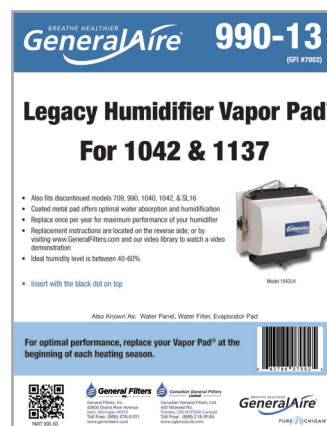
990-13 Vapor Pad® (GFI #7002)