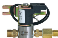
1099-42 Solenoid Valve