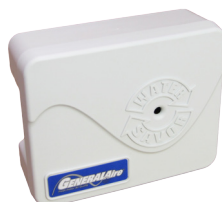
Water Savor Controller Reduce water use by a minimum of 50%!