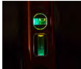
Super Bright High-Definition LED Vials (Cat No. 935RBLT)