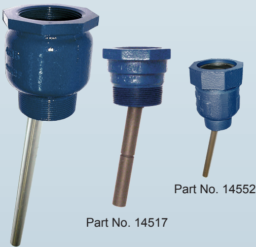
Part No. 14516