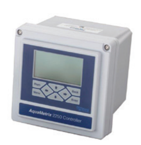
#9005 pH Monitor