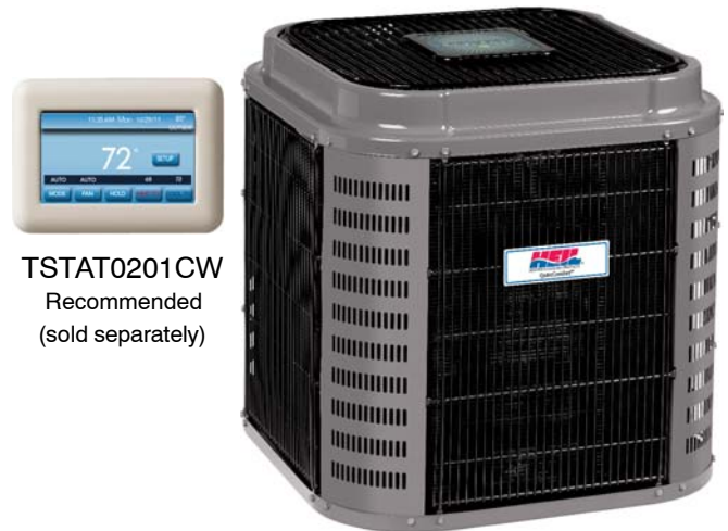
TSTAT0201CW Recommended (sold separately)