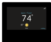
Ion Black System Control

We offer a complete family of products designed to provide year-round comfort, control and efficiency. A Heil split-system air conditioner is a properly matched combination of an outdoor air conditioner and a separate indoor unit such as a natural gas, oil, propane or electric furnace or a fan coil. Your Heil dealer can help create a properly matched system to best fit your needs and your budget.