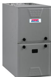
Ion Series Gas Furnaces