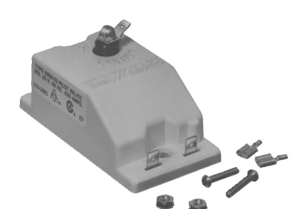
5059-23 Pilot Relite Control