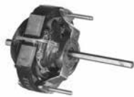
FIG. A D200, D201