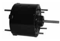
FIG. E D228