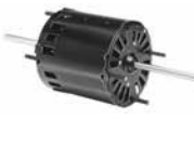
FIG. K D209