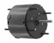
FIG. H D402, D403