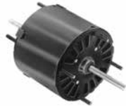
FIG. F D207