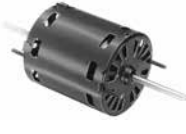
FIG. G D213, D211