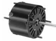
FIG. D D202, D203, D206, D210, D216