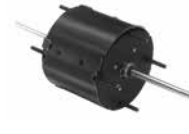
FIG. I D205