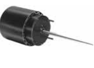
FIG. L D214, D215, D220