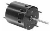
FIG. J D608, D208