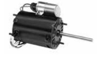
FIG. O D503