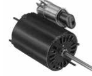
FIG. N D404, D405