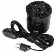
FIG. B D1130