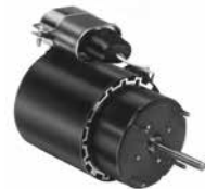
FIG. M D218, D219