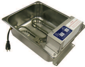
For further information refer to Product Sheet F221