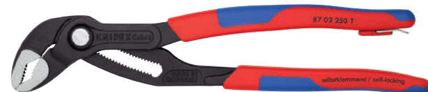
87 02 250 T BKA