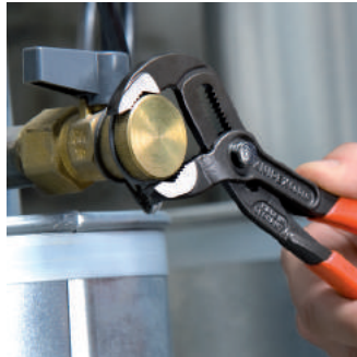
Fast and firm adjustment directly on the workpiece