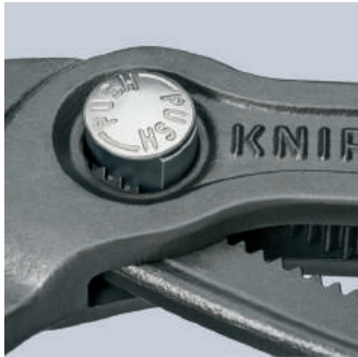
Fine adjustment by pushing a button: fast and comfortable

Pliers with integrated tether attachment point for tool drop protection system