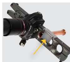
Sliding depth gauge sets tube at exact height