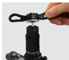
Ratchet handle with forward and reverse speeds flaring