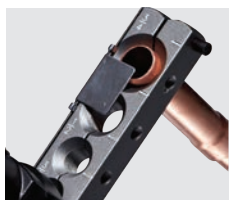
Sliding depth gauge sets tube at exact height