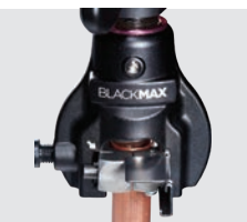
Eccentric forming cone for easier flaring