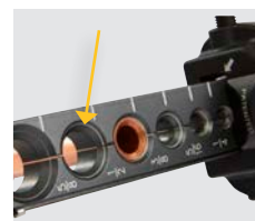
Laser etched sight gauge verifies proper flare