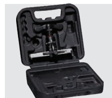
Molded Storage Case