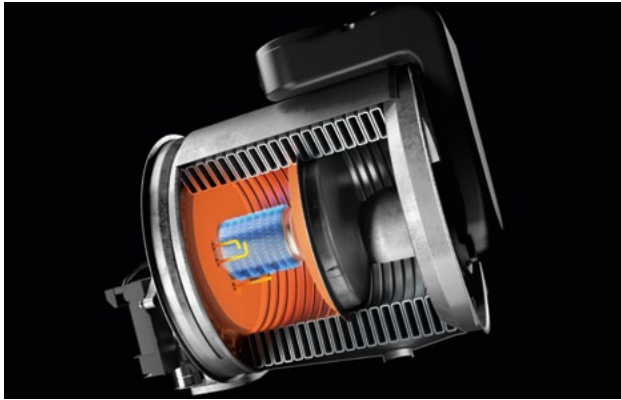
Low-emission, Viessmann-made MatriX Plus cylinder burner

The proprietary Viessmann modulating Lambda Pro Plus combustion control offers clean combustion, 10:1 turn down ratio and quiet operation with either propane or natural gas, which can be changed at the push of a button.