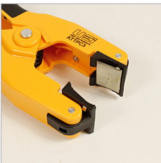
Rugged contacts with a large surface area