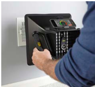
Up to 12" x 12" vents