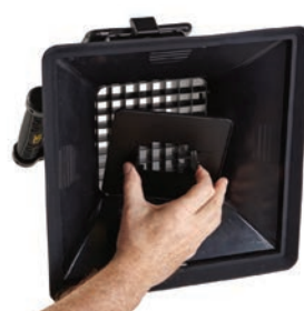
Low airflow adapter plate