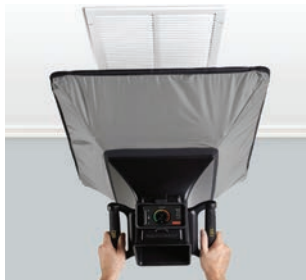
Up to 24" x 24" vents with Expansion Hood