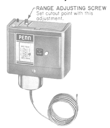
Fig. 1 -- Electric thermostat shown with manual reset.

to a wall surface or panel board using the two mounting holes provided in the back of the case. The desired mounting position is with the element bellows pointing down.