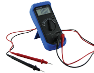
Item ID Description