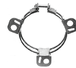
Universal Lug Mounting Bracket