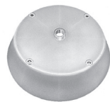
Rainshields - Plastic Deep Dish Style