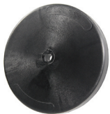
Condenser Fan Rainshield Deep Dish Style