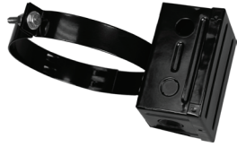
Conduit Box with Adjustable Bracket