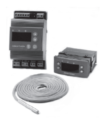
MR4 Series DIN Rail and Panel Mount Modules