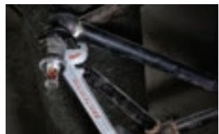
Jaw Capacity 1-1/2"