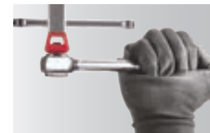
Ratchet-Ready Less jaw readjusting