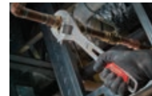
Perfectly Parallel Jaws