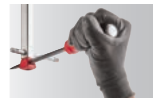
Screwdriver-Ready Up to 2X breakaway torque