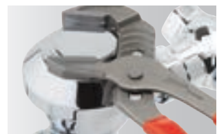
Non-Marring Smooth Jaw for Finish Applications