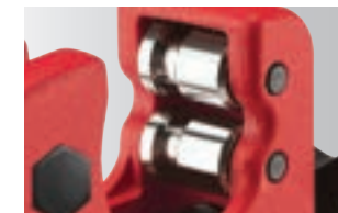
Chrome Rollers Rust Protection