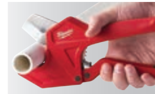
Comfortable Handle Design