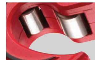
Chrome Rollers Rust Protection