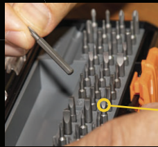
Industrial-strength heat treated bits