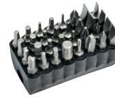
STANDARD BIT SET SOLD SEPARATELY 32526