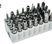
TAMPERPROOF BIT SET INCLUDED WITH SET, ALSO SOLD SEPARATELY 32525