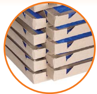
Pinch Frame Design