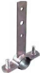
COPPERIZED MILFORD HANGERS