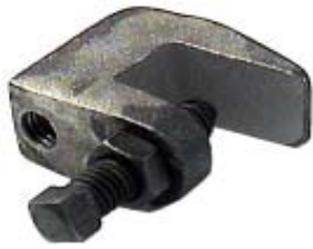
JR. TOP BEAM CLAMPS