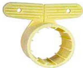
PVC SUSPENSION CLAMP

- Isolates tubing from wood to prevent vibration noise