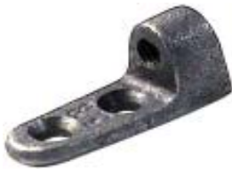
SIDE BEAM CONNECTORS