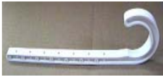
WHITE ABS J-HOOKS