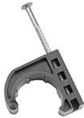
PVC TUBE NAILER