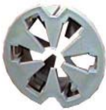
PVC METAL STUD INSULATORS

- For copper, PEX, and polybutylene tubing