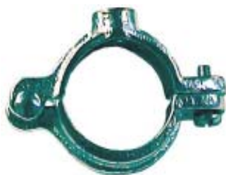
SPLIT-RING HANGER (HINGE-TYPE)

Hinge design makes installation easier and saves time