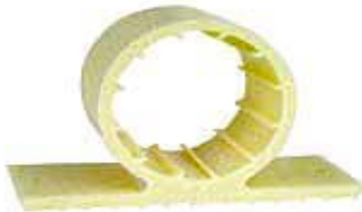
PVC TWO-HOLE PIPE STRAPS