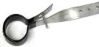
PVC-COATED DWV HANGERS