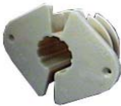
PVC PIPE INSULATORS

- For copper, PEX, and polybutylene tubing - Plastic two hole pipe clamp reduces noise from tubing expansion & contraction.