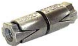
DOUBLE EXPANSION SHIELDS