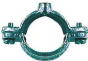
SPLIT-RING HANGER (SCREW TYPE)