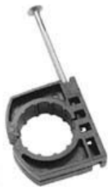
PVC "ALL-AROUND" NAILER

- Plastic half clamp preloaded with nail. For copper, PEX, CPVC and polybutylene tubing.