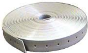
PERFORATED PVC HANGING TAPE

- 3/4" x 10 foot - With nail holes (1/4" )