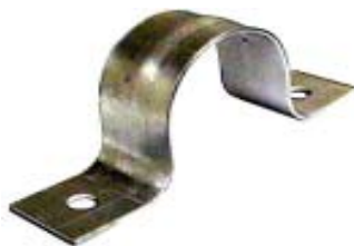
GALVANIZED TWO-HOLE PIPE STRAPS