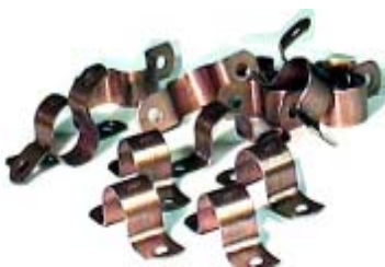
COPPER-CLAD TWO-HOLE PIPE STRAPS