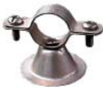
COPPERIZED BELL HANGERS