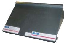
Galvanized cover PN: 960000