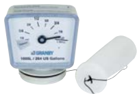
Gauge PN: 962247 – 720 L / 190 USG 962248 – 1000 L / 265 USG