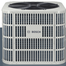
15 SEER 2 Ton System

Up-to $200 instant discount (1) + $100 in cash redeemable points (2)