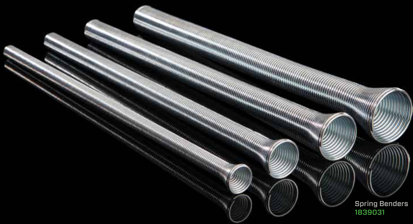
Spring Benders 1839031