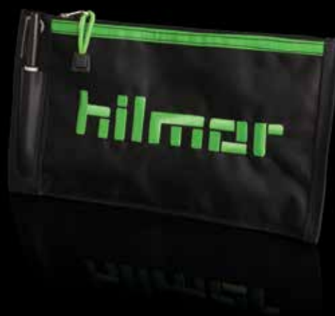
Zipper Pouch 1839081