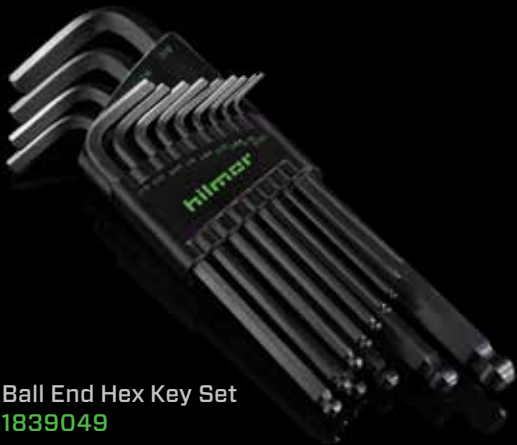
Ball End Hex Key Set 1839049

Get the full socket contact you need. Our slip-resistant Folding Hex Key Set includes hex keys from 5/64" to 1/4". And the ball ends of our Ball End Hex Key Set let you access and turn hard-to-get-at fasteners at up to 30° angles. Get equipped with all the hex keys you need in sizes 0.05" to 3/8".