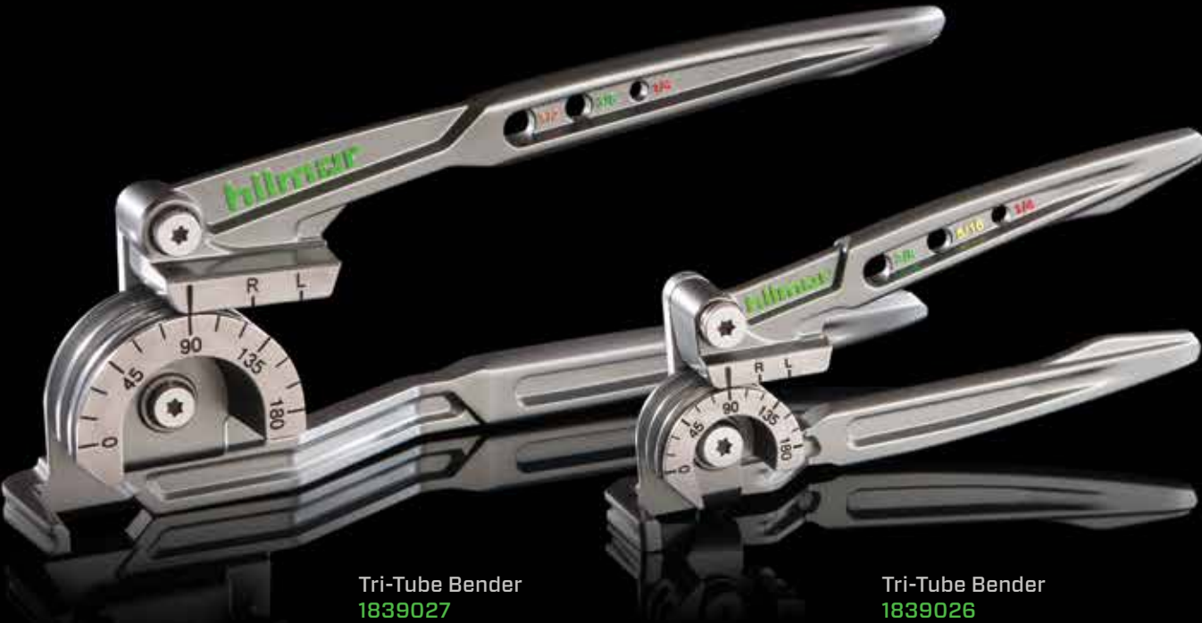
Tri-Tube Bender 1839027

Correctly align the tube size with color-coded indicators.