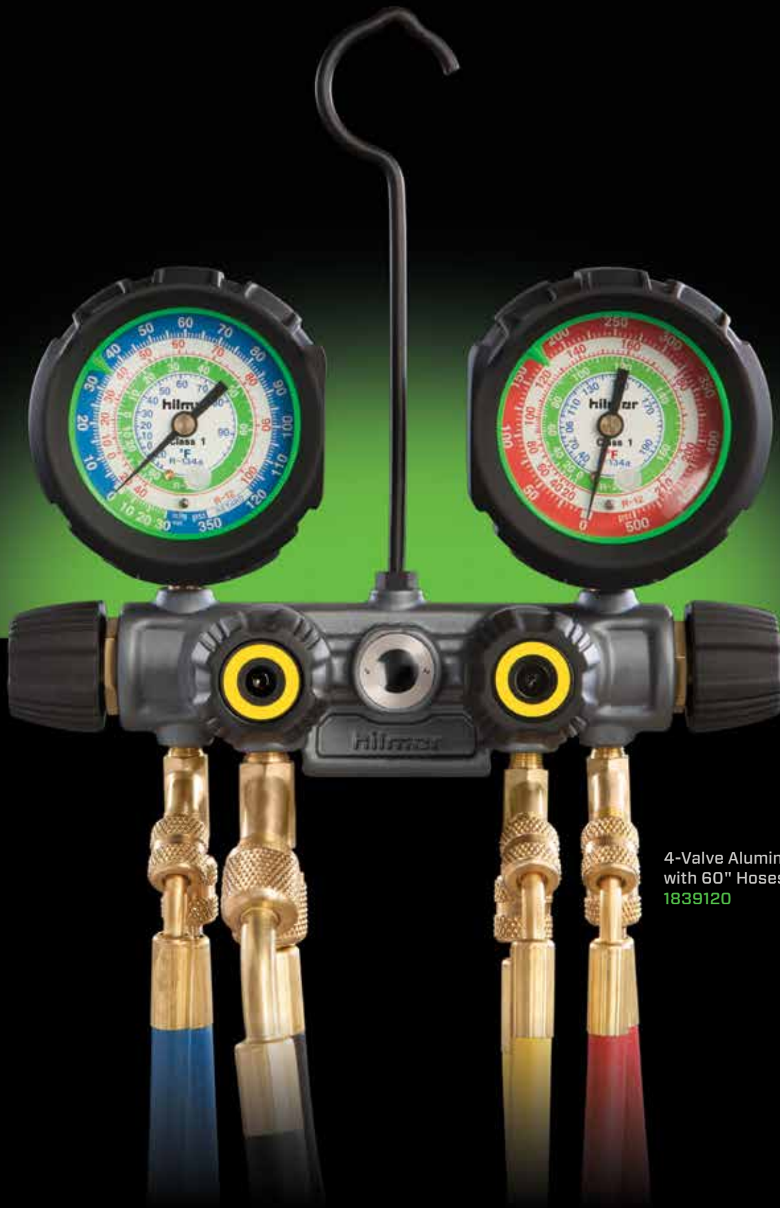
4-Valve Aluminum Manifold with 60" Hoses 1839120