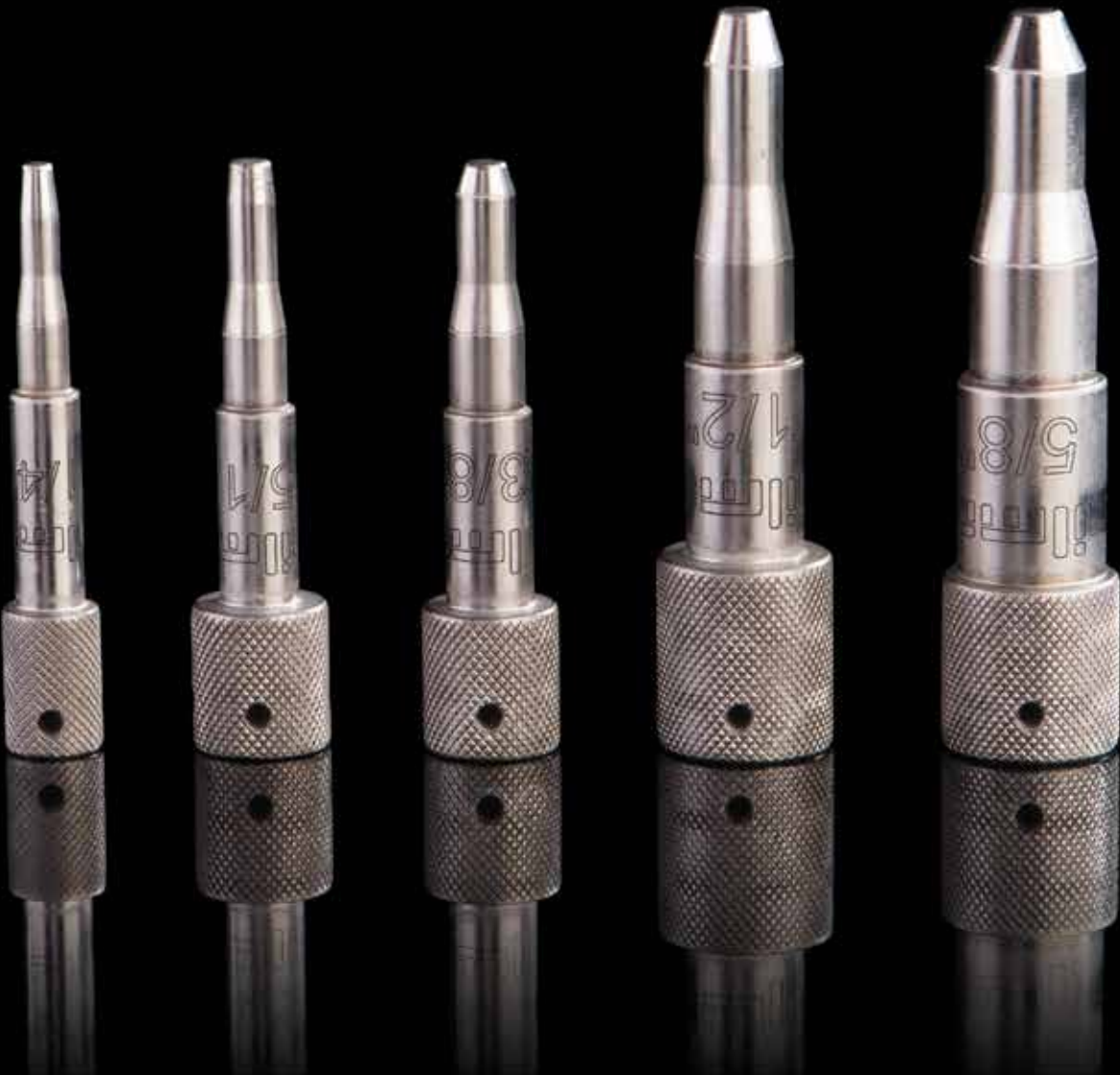
Punch Swage Set 1839008