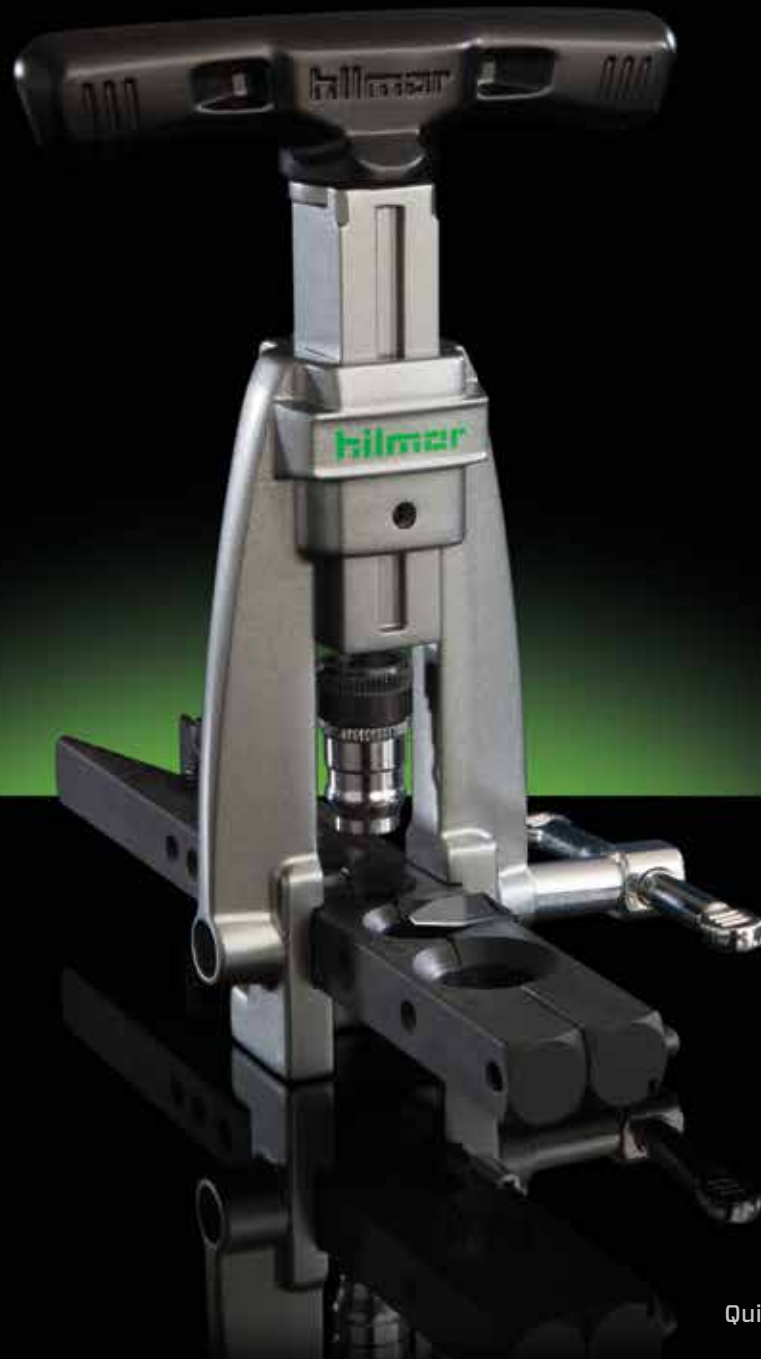
Quick-Engage Flare and Swage 1838947