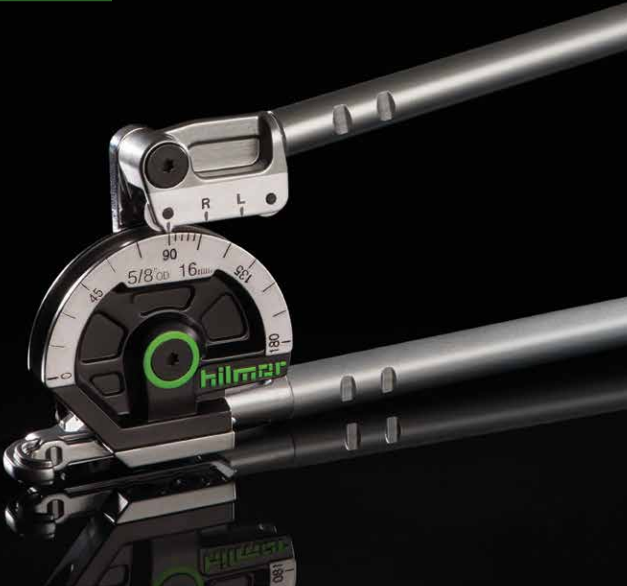
Lever Bender 1839028