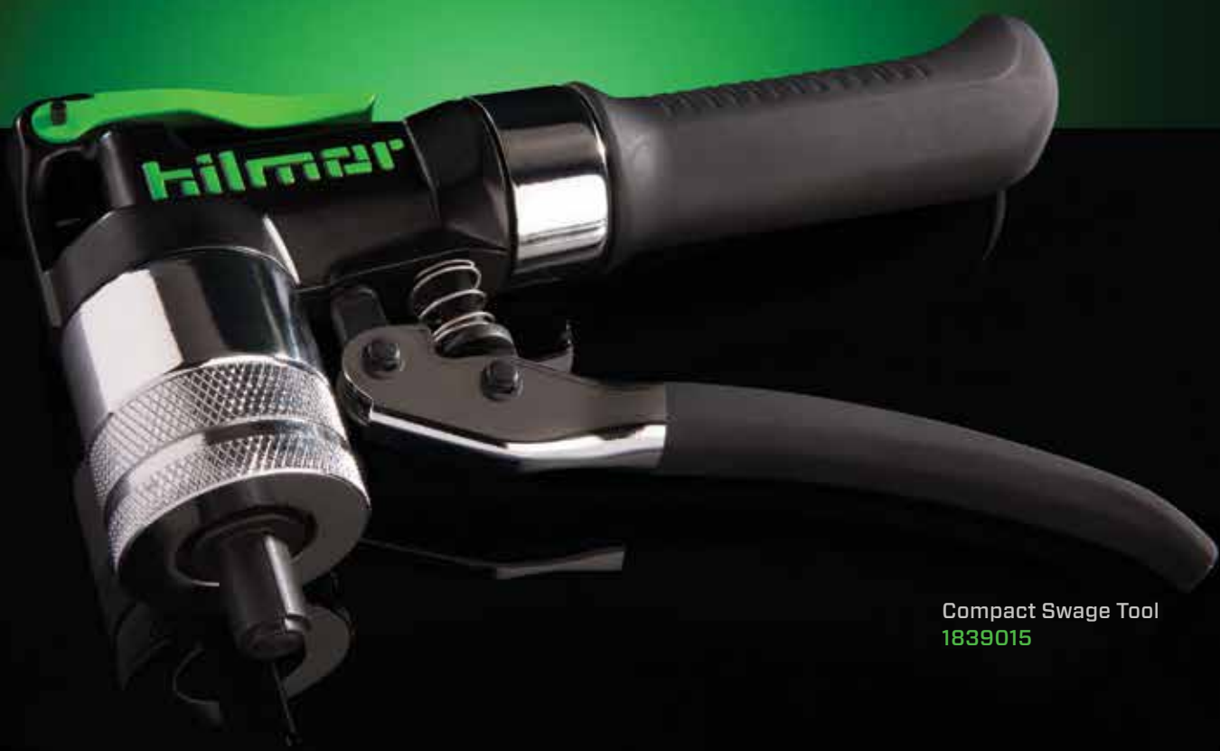
Compact Swage Tool 1839015