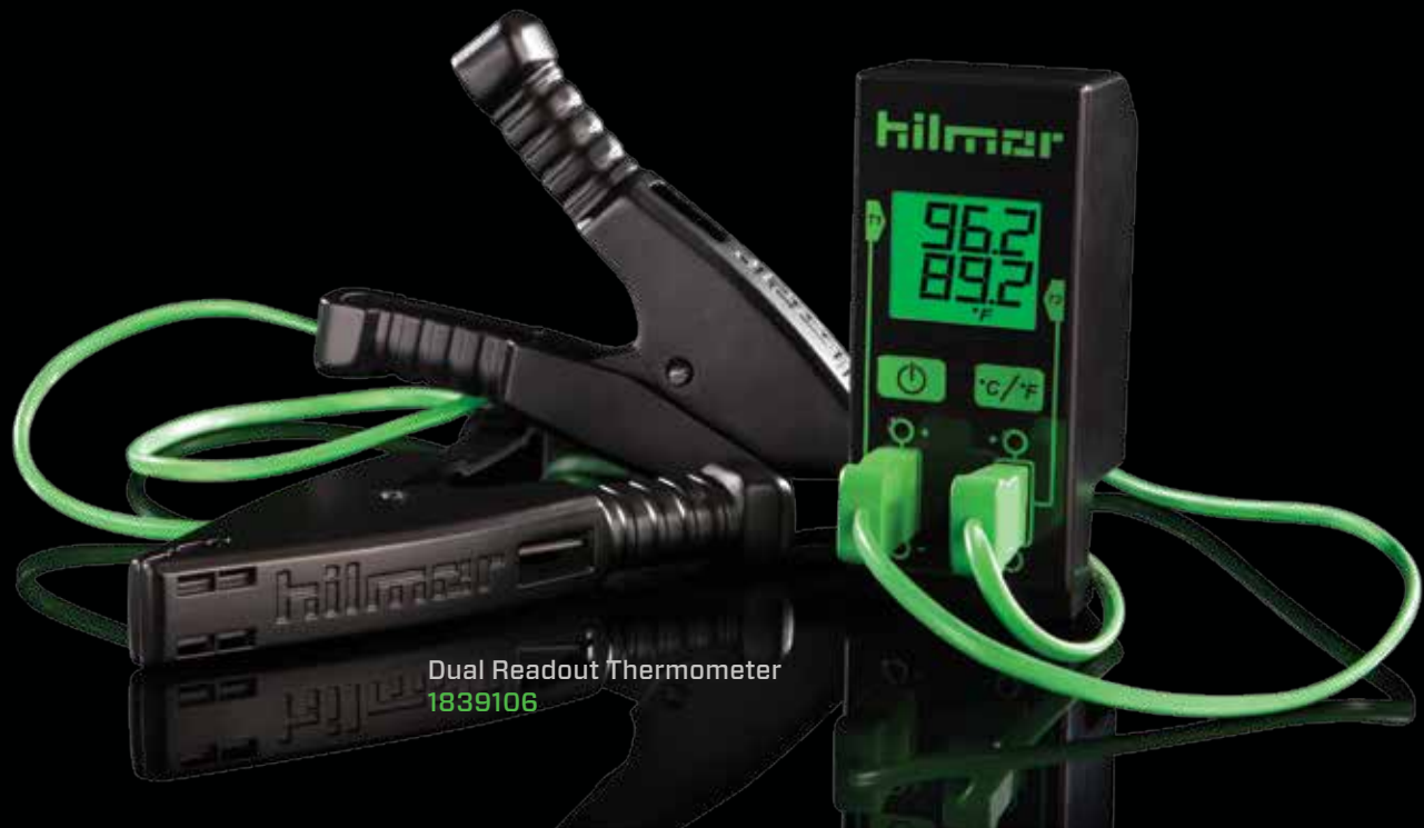
Dual Readout Thermometer 1839106