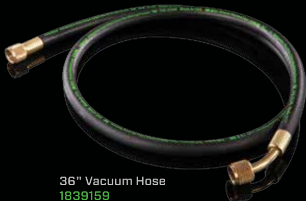
36" Vacuum Hose 1839159

Rated for 800 PSI working pressure to work with high-pressure refrigerants.