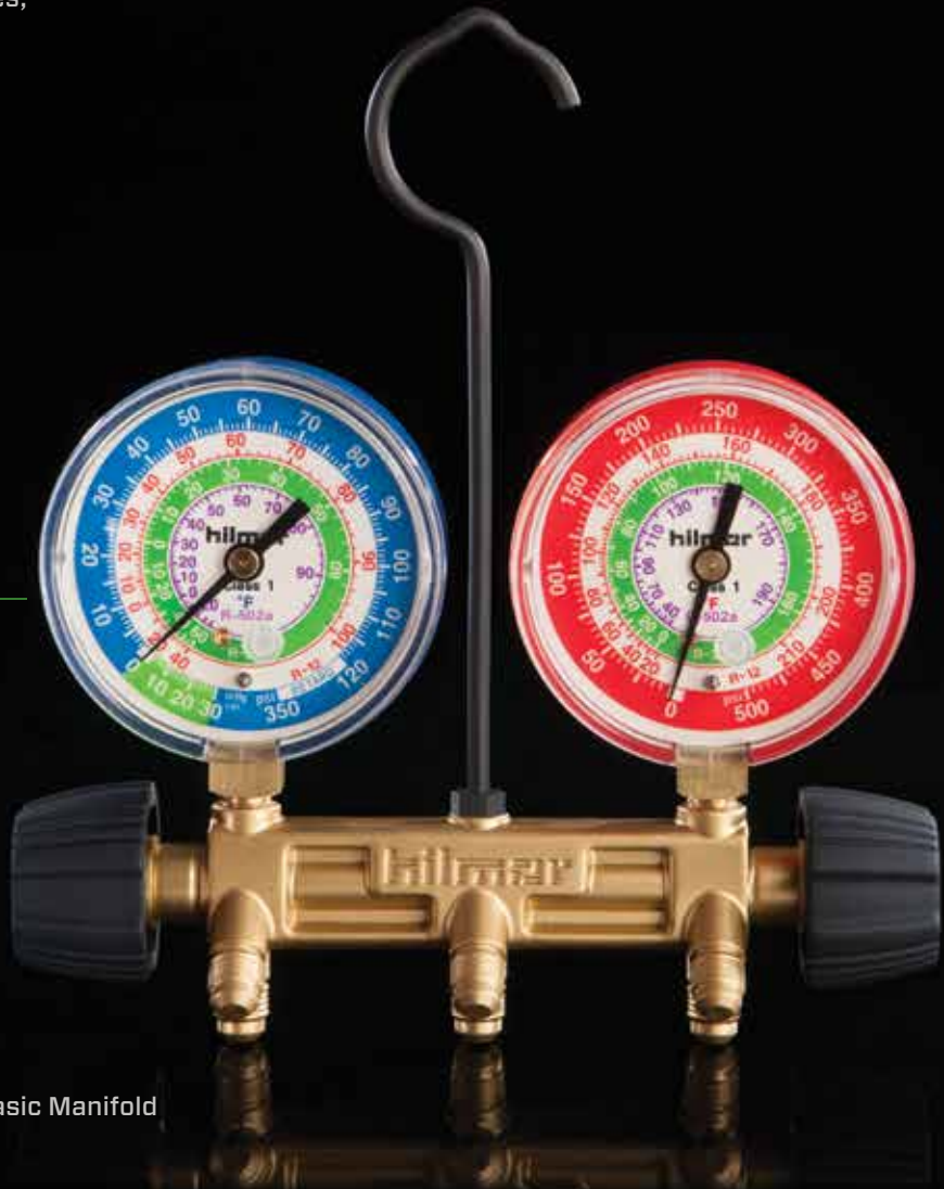
2-Valve Basic Manifold 1839119

Rated for 800 PSI working pressure to work with high-pressure refrigerants.