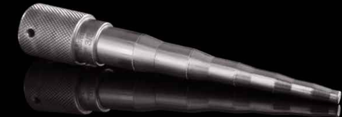
Multi-Swage Punch 1839009