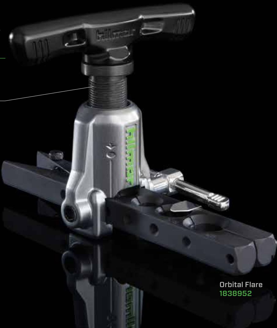
Orbital Flare 1838952