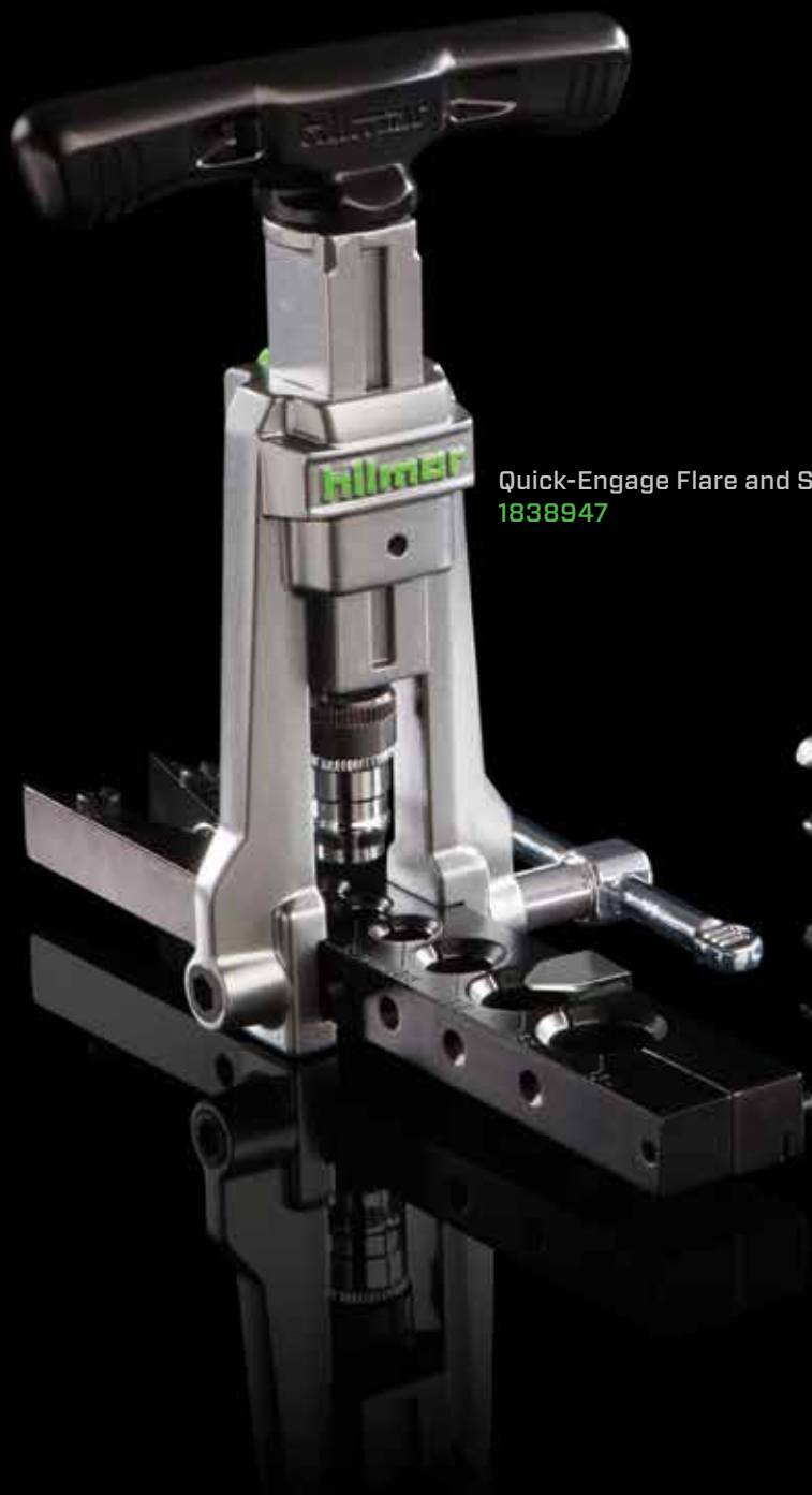
Quick-Engage Flare and Swage 1838947