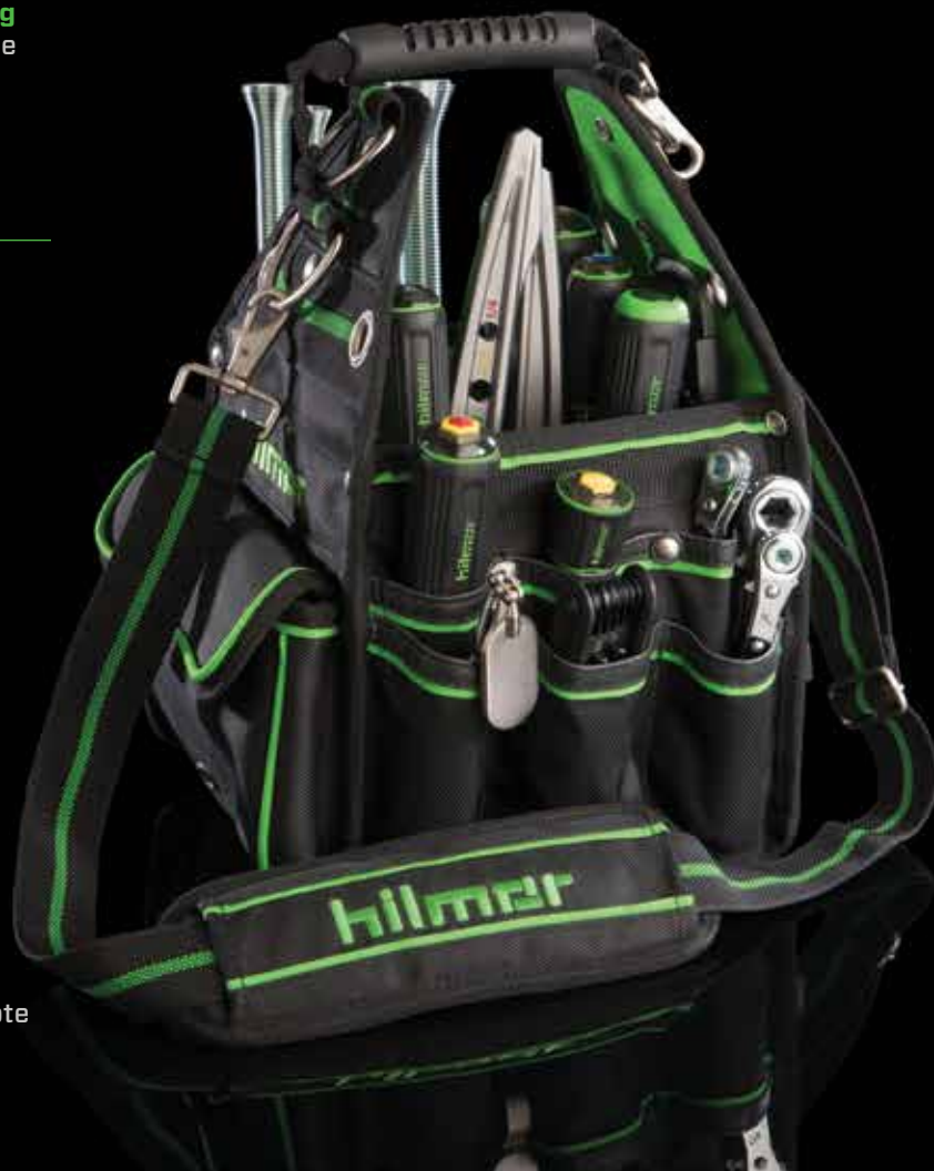
HVAC/R Tote 1839078