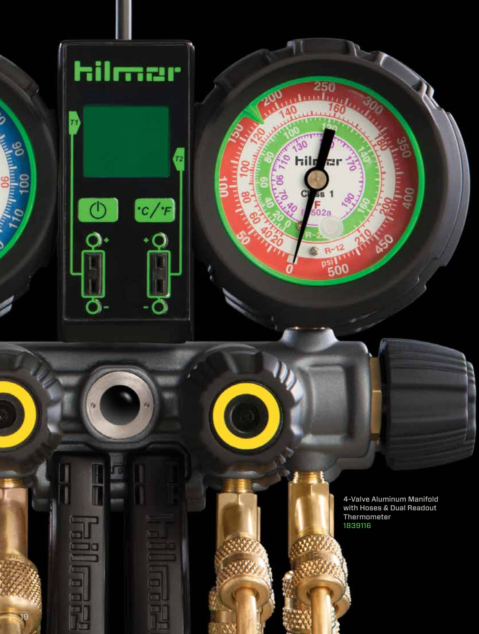
4-Valve Aluminum Manifold with Hoses & Dual Readout Thermometer 1839116