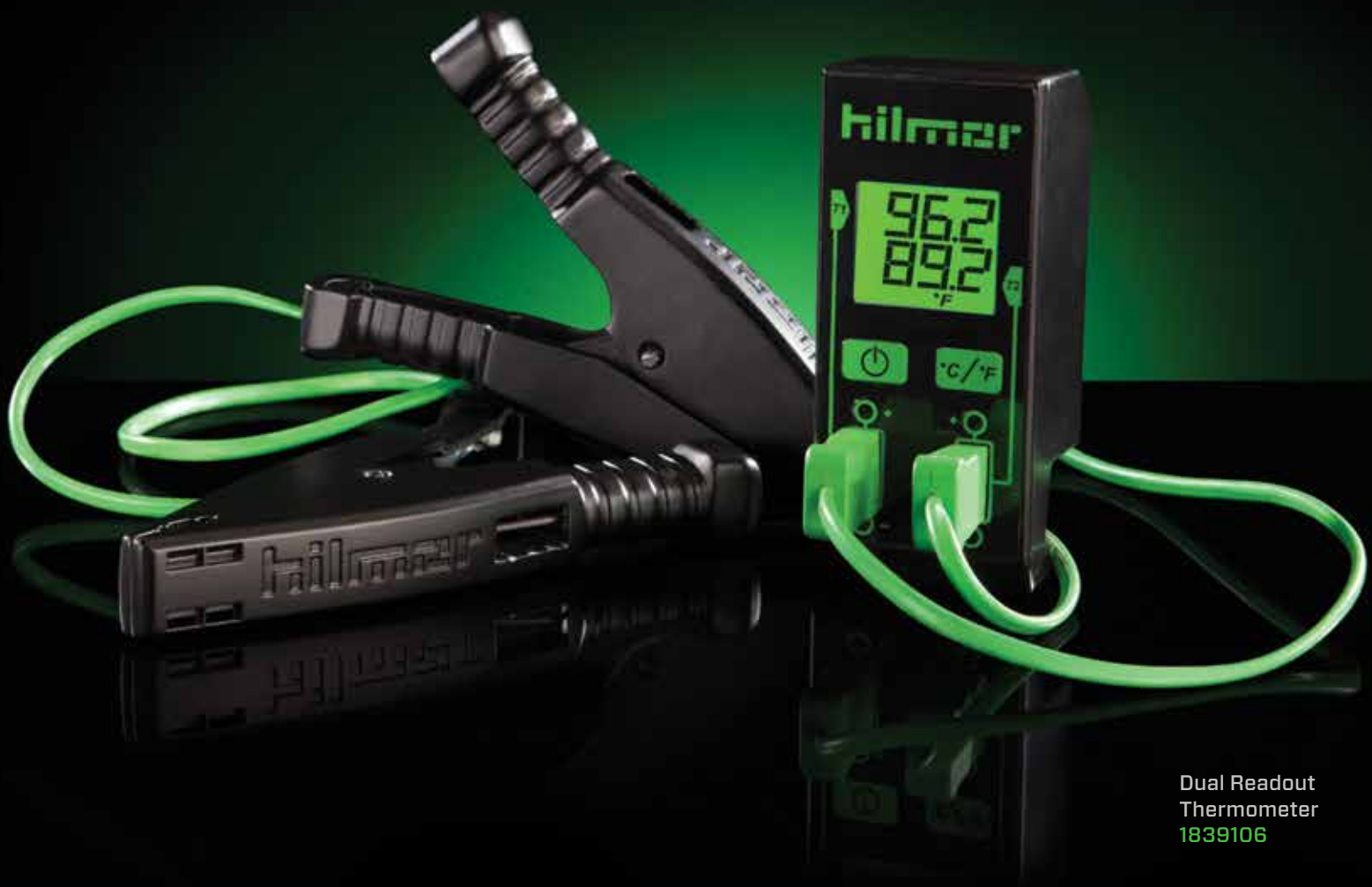
Dual Readout Thermometer 1839106