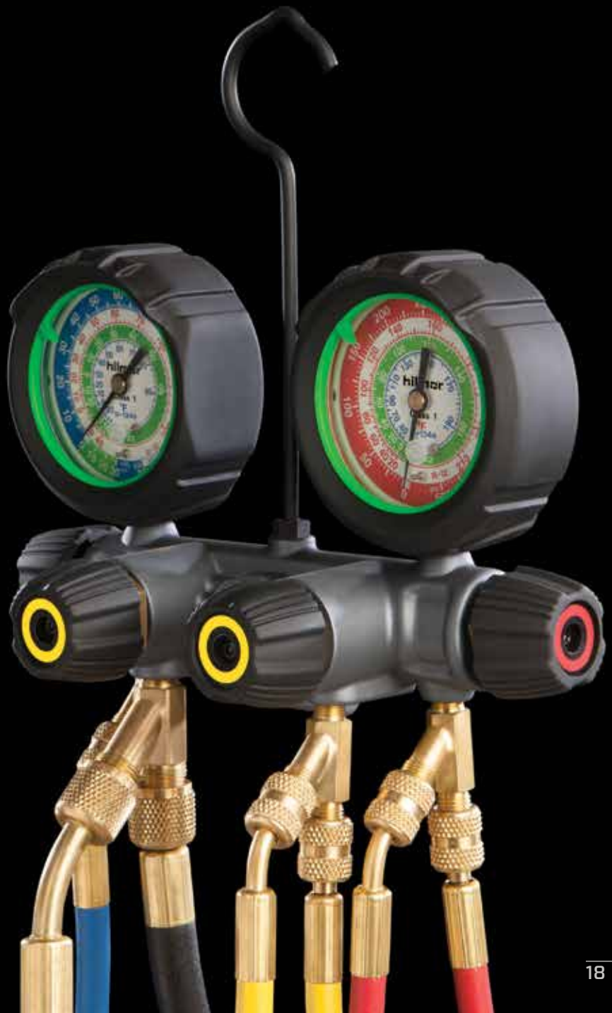
4-Valve Aluminum Manifold 1839120

Front-mounted hose positions give you easier access.