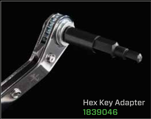
Hex Key Adapter 1839046

Smart features that save your knuckles and your time. Our Straight Service Wrench makes changing sizes quick and easy. Our Offset Service Wrench makes maneuvering around cramped spaces second nature. The reversible Ratchet Wrench has square openings of 1/4" and 3/16" on one end and 3/8" and 5/16" on the other end. And, when it comes to accessing liquid- and suction-based valves, reach for our Hex Key Adapter. It works on 3/16" and 5/16" hex valves.