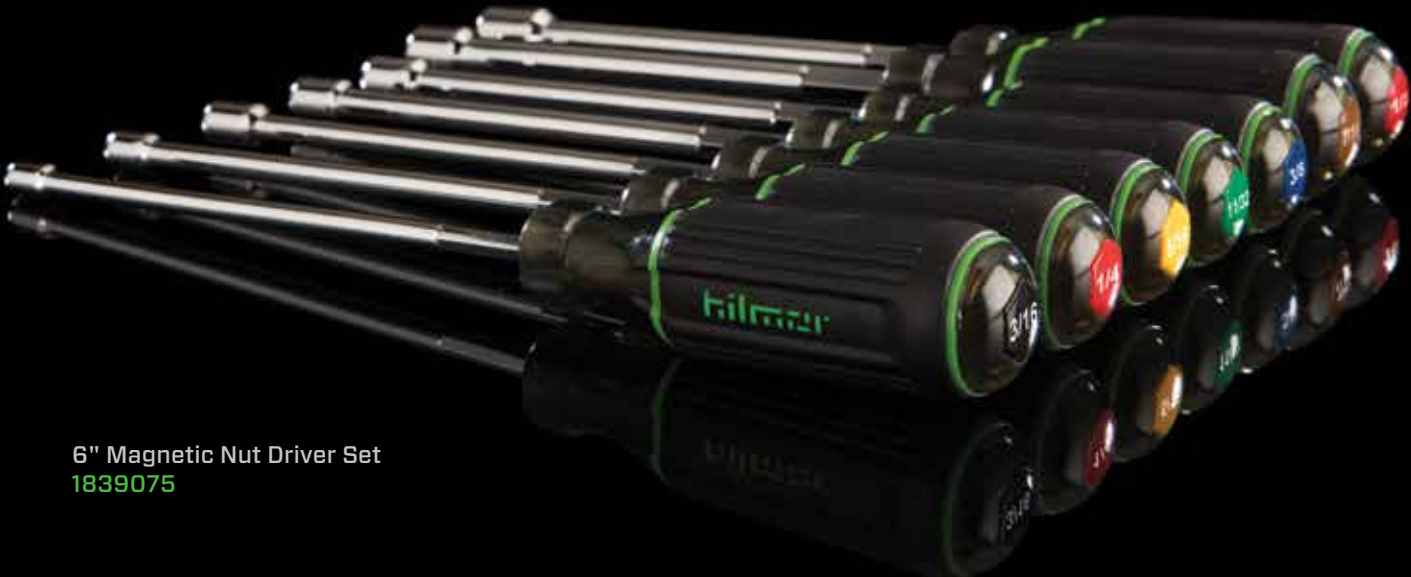
6" Magnetic Nut Driver Set 1839075

A wrench flat lets you tighten with a wrench for ease and extra confidence.