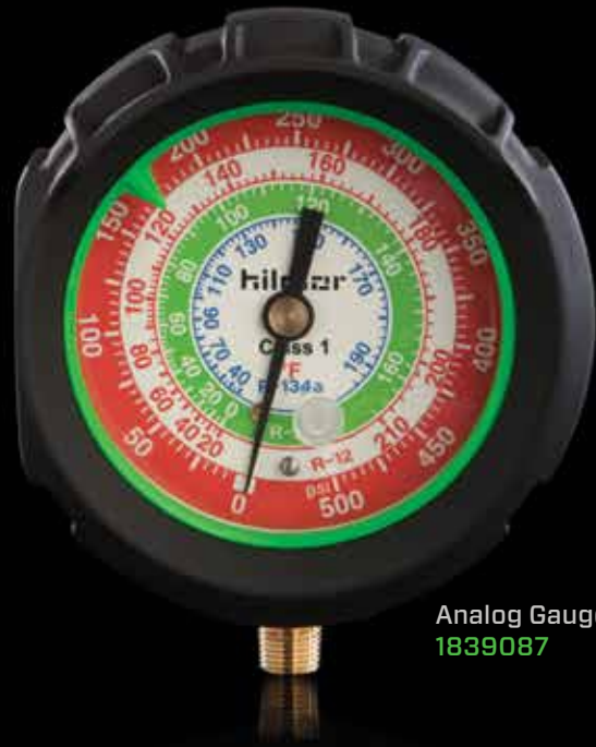
Analog Gauge 1839087