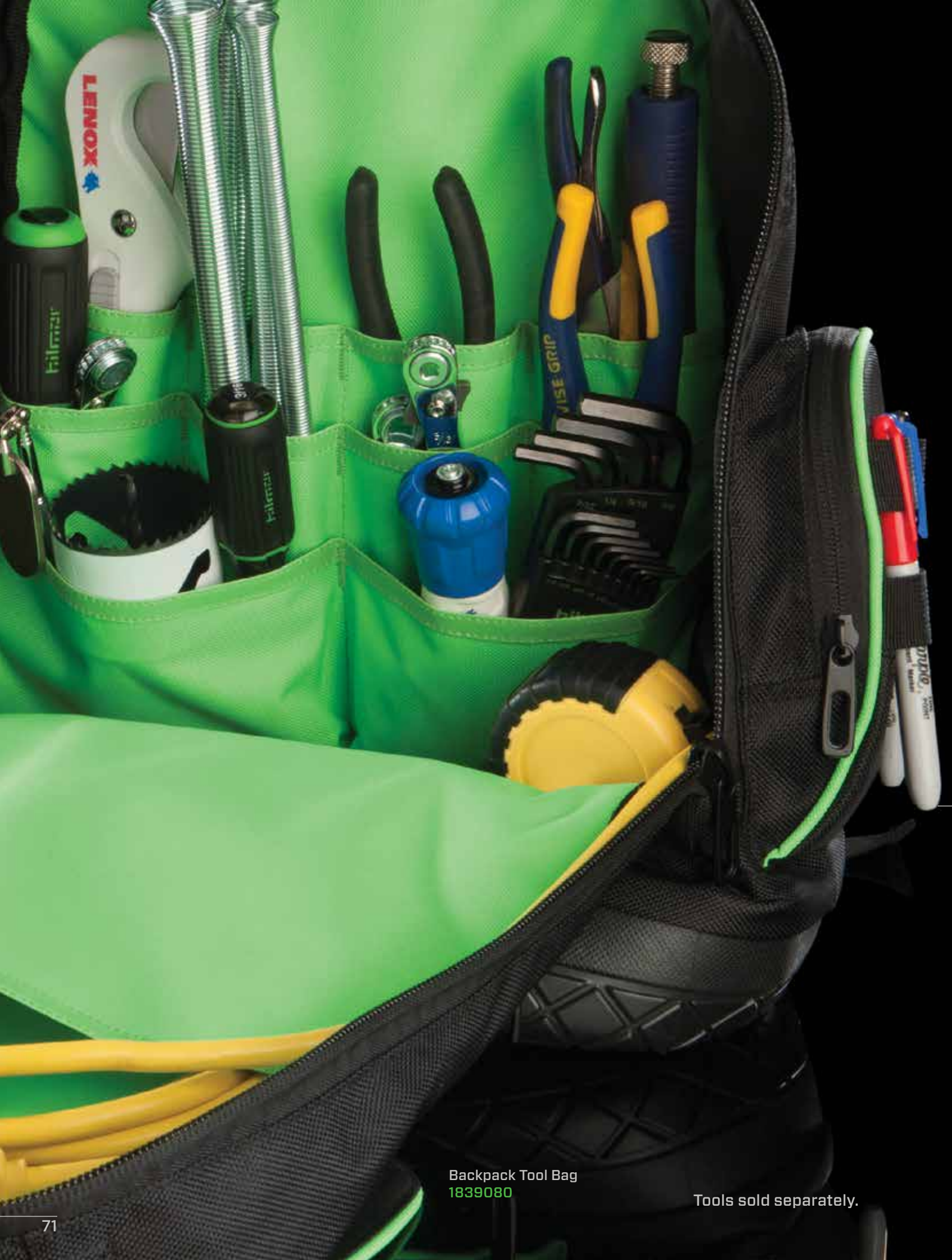
Backpack Tool Bag 1839080