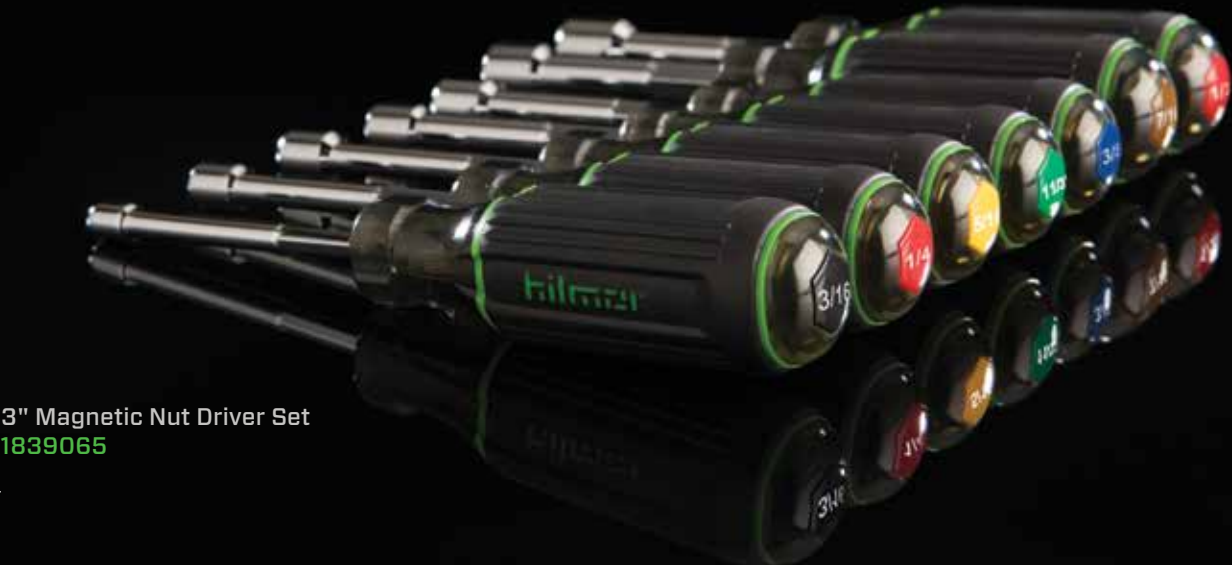
3" Magnetic Nut Driver Set 1839065

A color-coded insert makes size identification quick and easy.