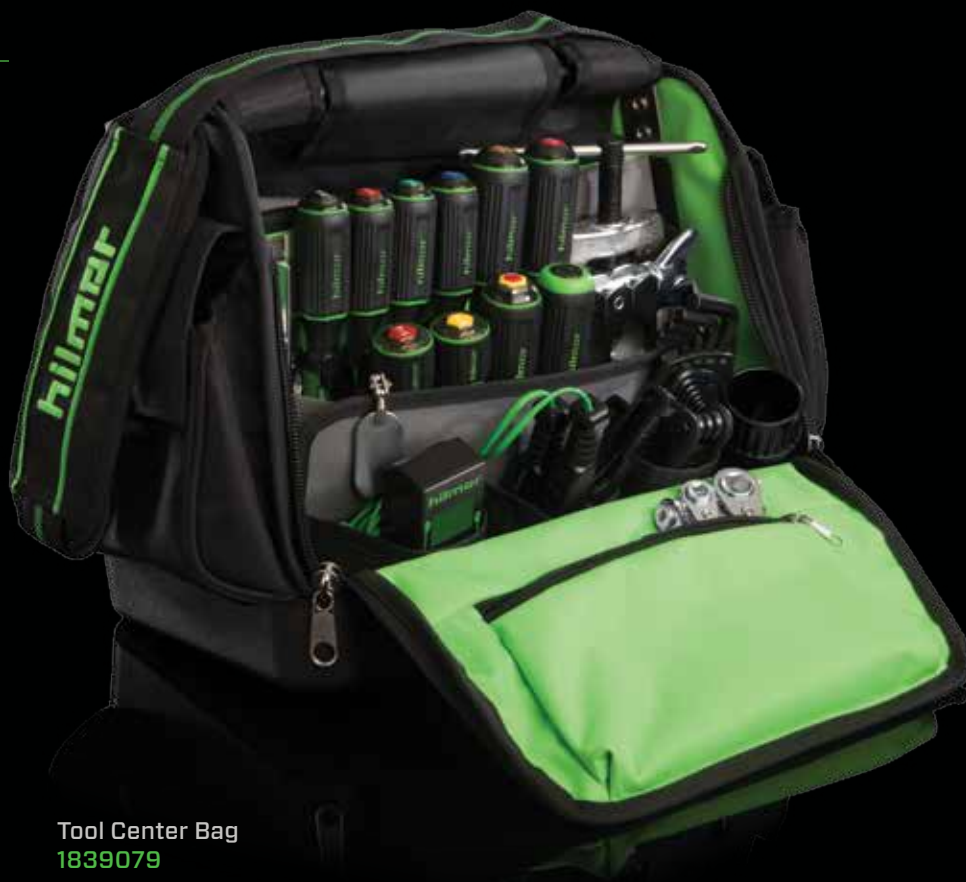
Tool Center Bag 1839079

Three zippered pouches and two padded side pockets provide safe storage for your meter.