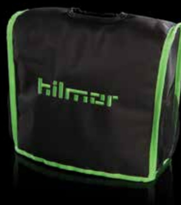
Manifold Cover 1839050