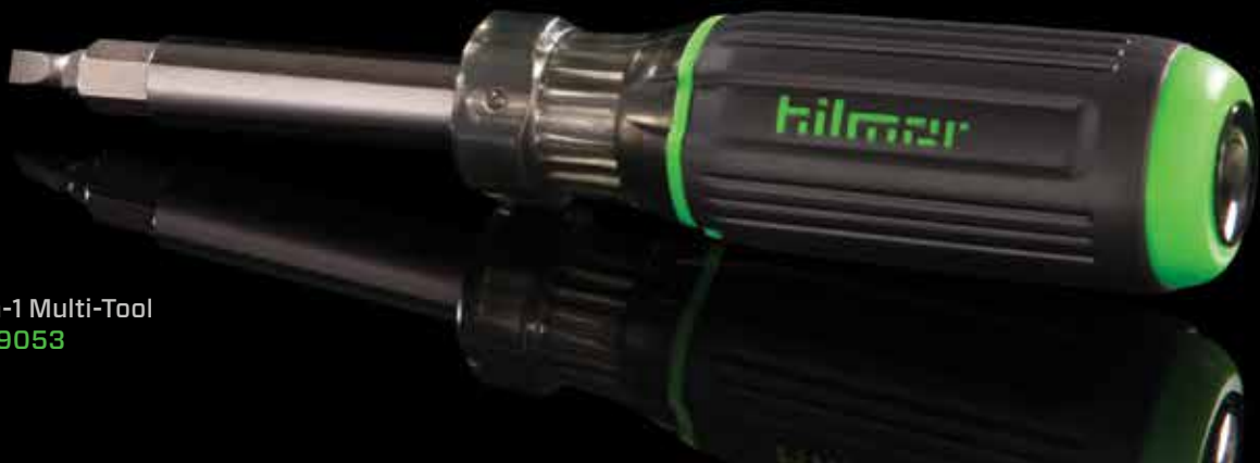
9-In-1 Multi-Tool 1839053