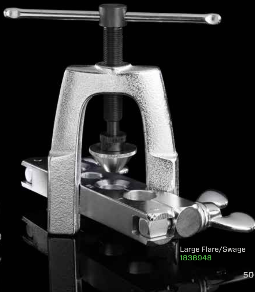
Large Flare/Swage 1838948