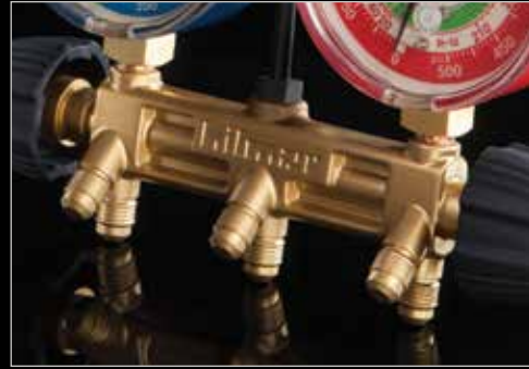
Front-mounted hose positions give you easier access.

The gauges have been optimized for greater 3-1/8" readability with improved graphics, high-contrast color and glow-in-the-dark functionality. Sold with hilmor 60" hoses.