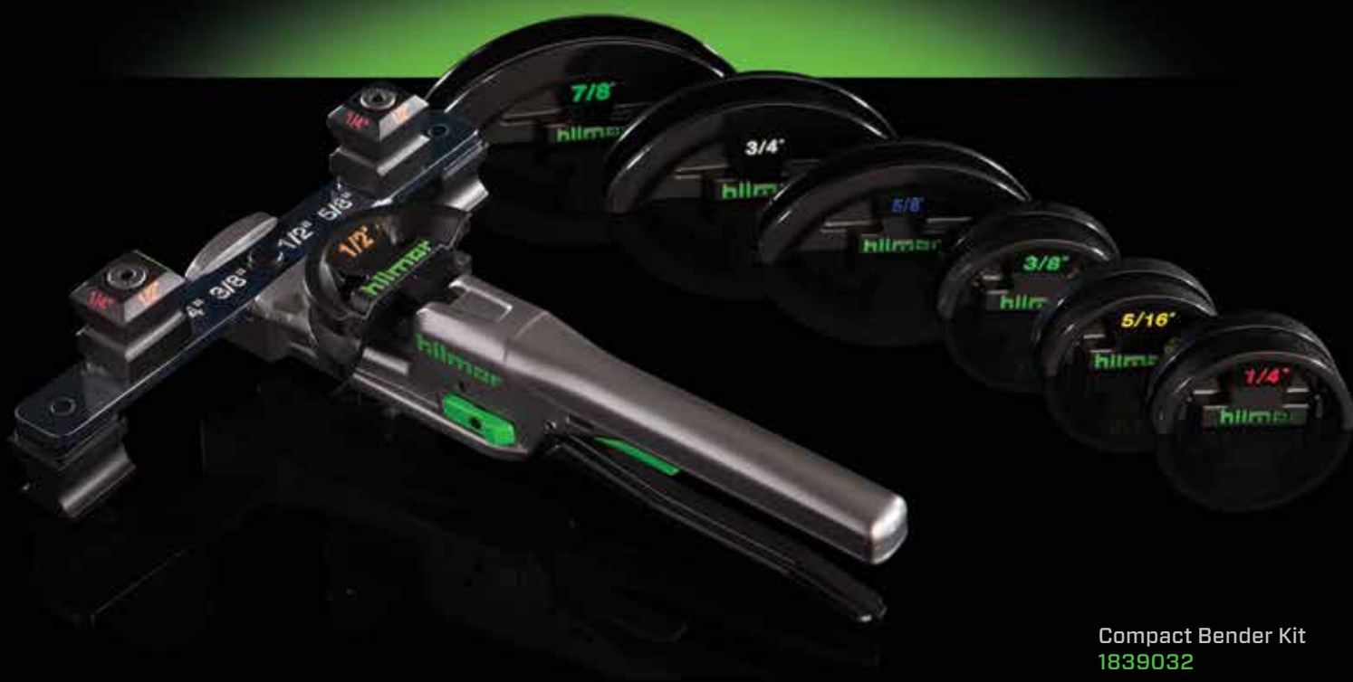
Compact Bender Kit 1839032