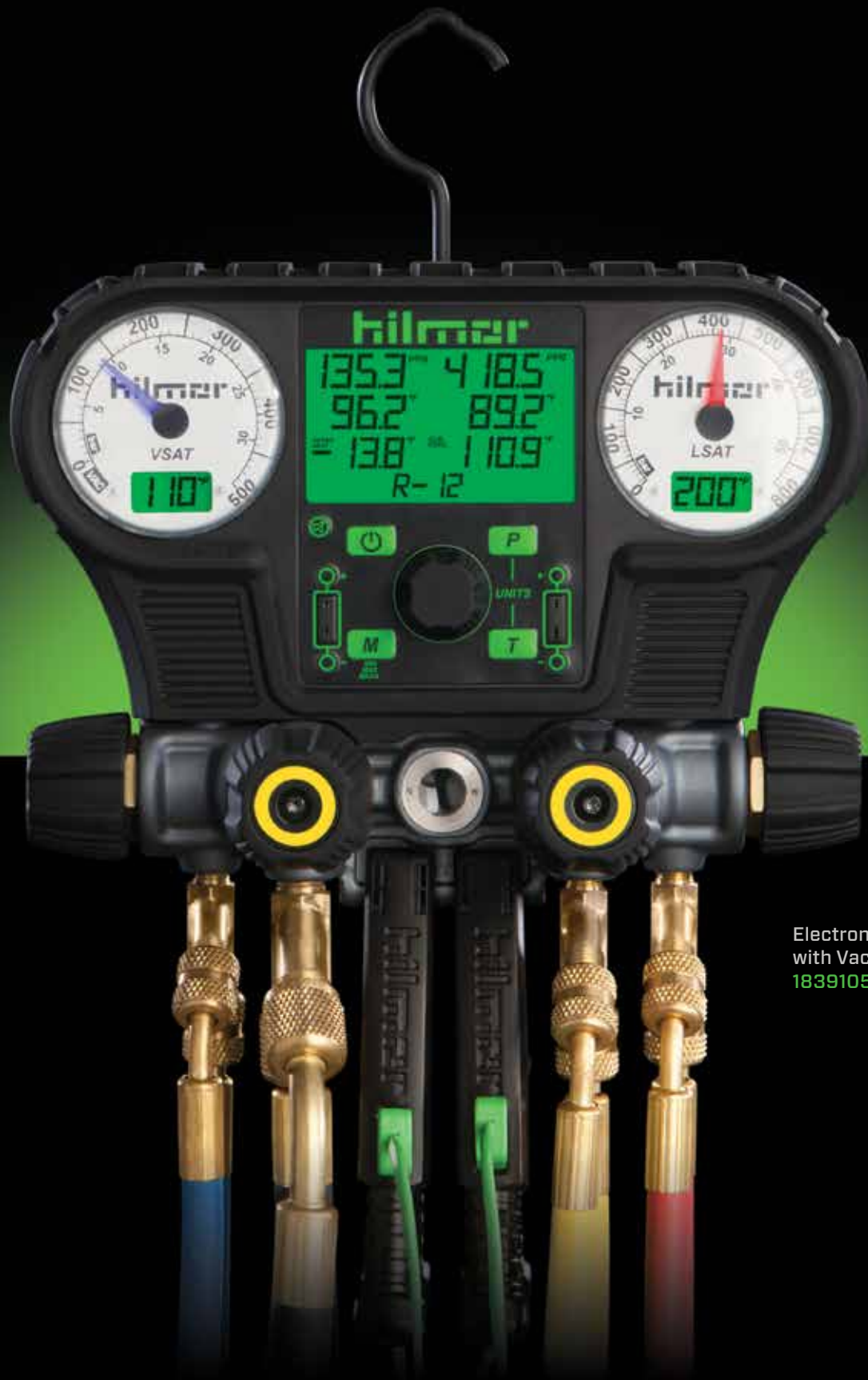
Electronic Gauge with Vacuum Sensor 1839105