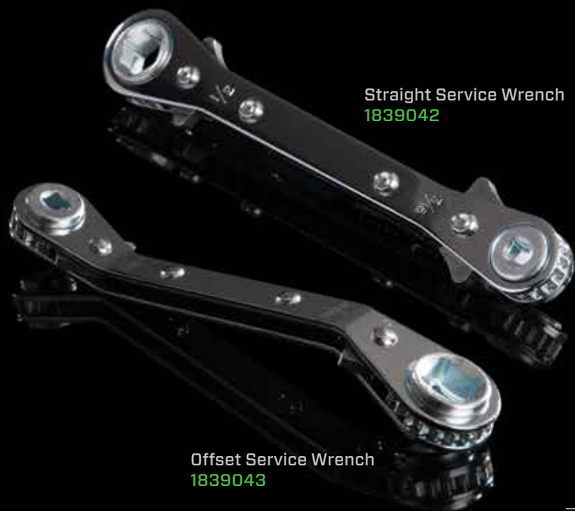
Straight Service Wrench 1839042