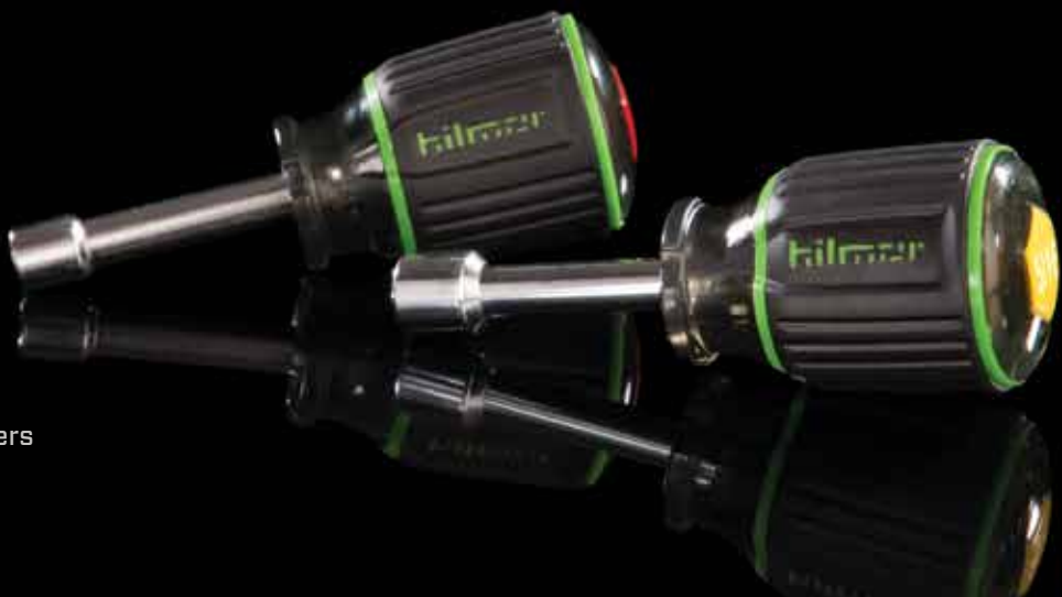
1-1/2" Magnetic Nut Drivers 1839055, 1839056