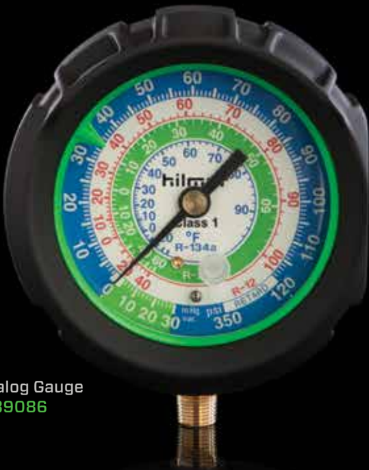
Analog Gauge 1839086