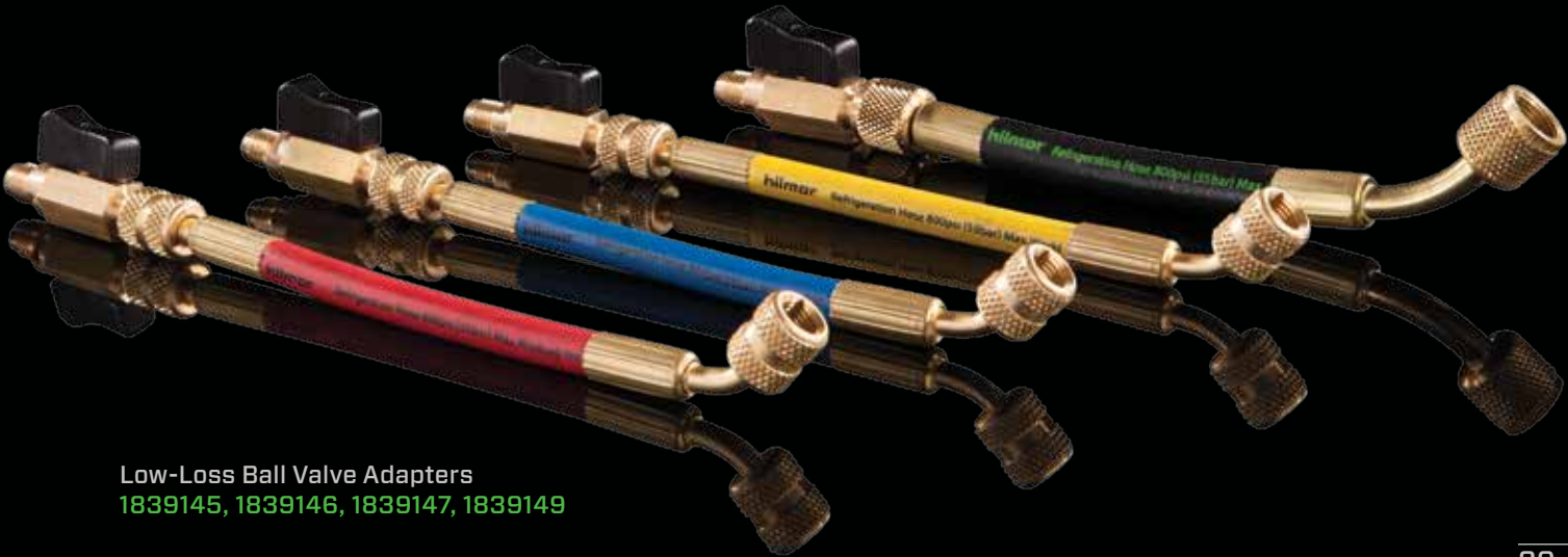
Low-Loss Ball Valve Adapters 1839145, 1839146, 1839147, 1839149