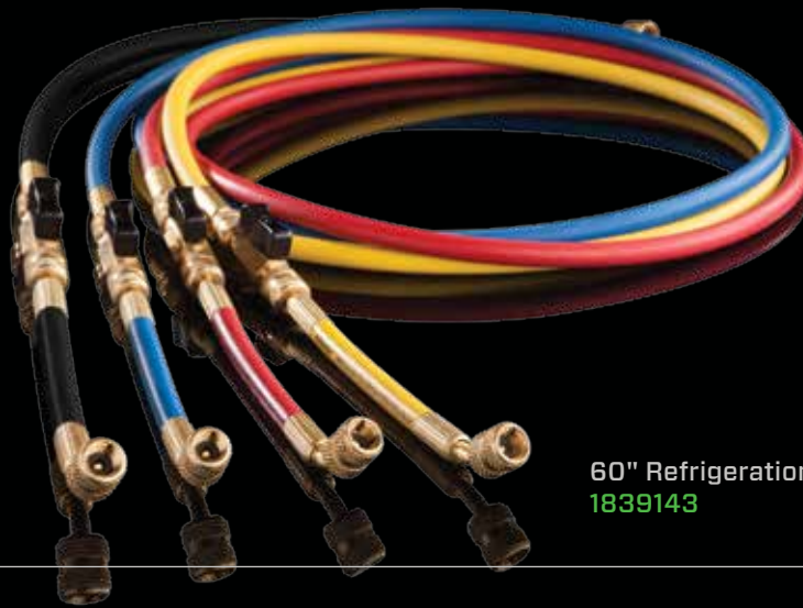
60" Refrigeration Hoses 1839143

If you can stand the pressure, your hoses should, too. We've rethought and retooled the hoses you use every day with smart features like an extra abrasion-resistant layer for superior protection in tough conditions. All of our Hoses are rated for 800 PSI working pressure to work with the newest high-pressure refrigerants. Simply select the Hose and Ball Valves you need. You can choose from Hoses and Ball Valve Adapters individually, or buy them as a set.