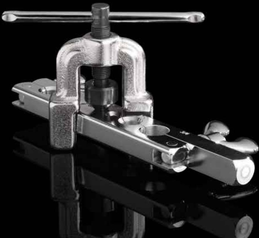
Basic Flare 1838956