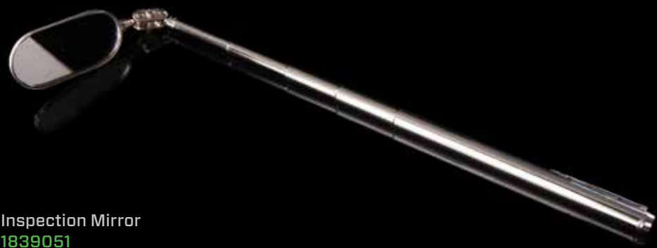
Inspection Mirror 1839051