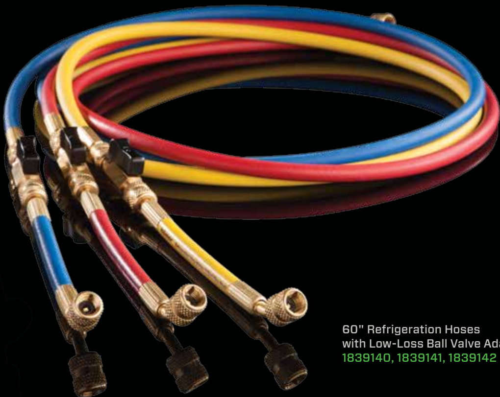
60" Refrigeration Hoses with Low-Loss Ball Valve Adapters 1839140, 1839141, 1839142