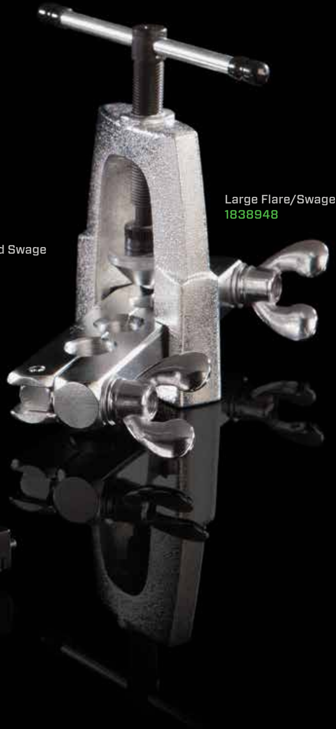
Large Flare/Swage 1838948