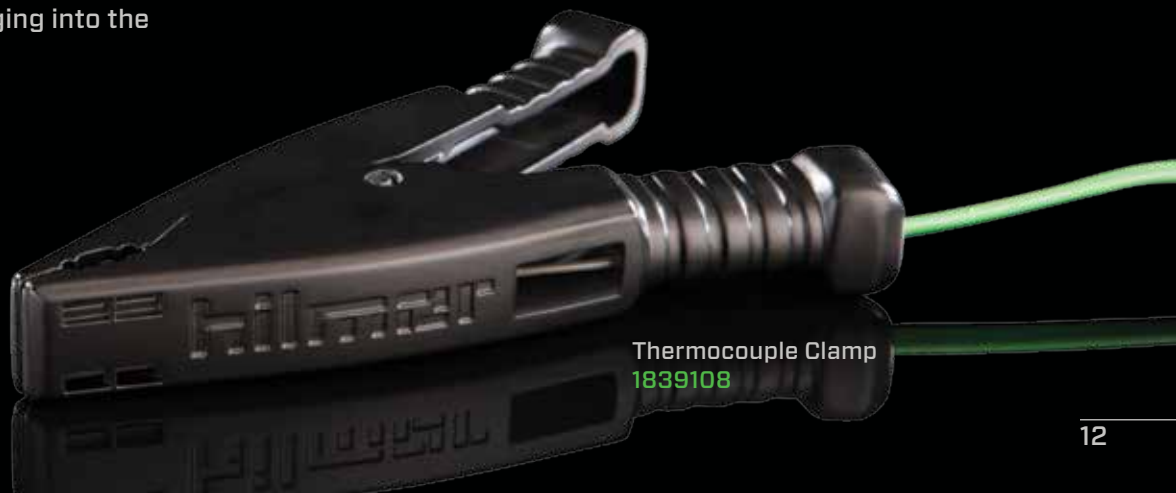
Thermocouple Clamp 1839108

K-style clamps securely attach to tubing up to 1-1/8" for measurements on the double.