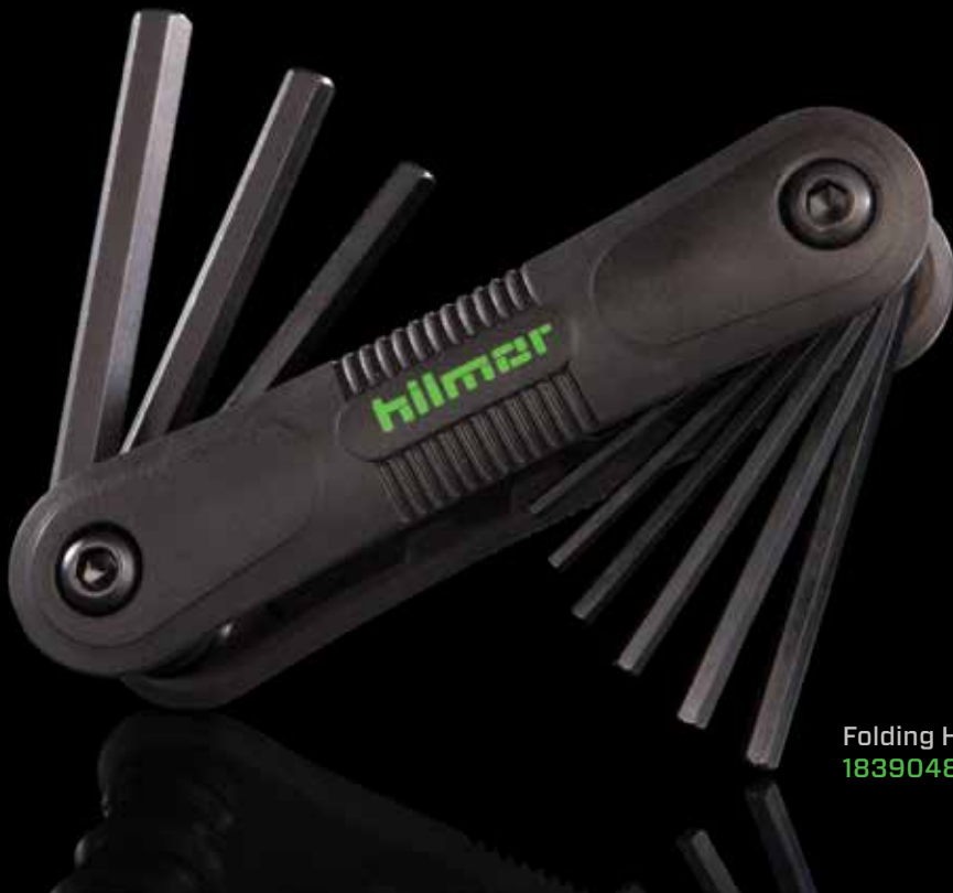
Folding Hex Key Set 1839048