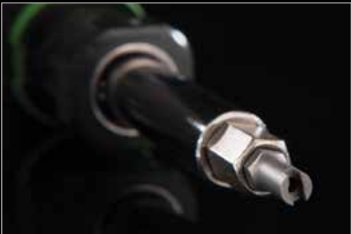
Includes a valve core remover.

Designed with thick shaft walls for long life and less stripping.