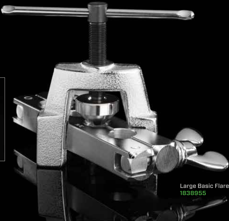
Large Basic Flare 1838955

Extra-long handle gives you additional leverage for easier flaring.