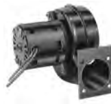
FIG. H A151