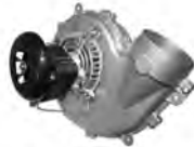
FIG. B A051