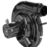
FIG. M A173