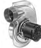
FIG. D A134