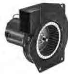
FIG. G A148