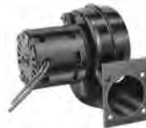
FIG. H A151