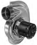
FIG. F A141, A174