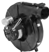
FIG. K A171