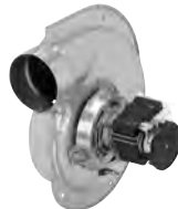
FIG. L A172