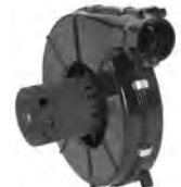
FIG. J A170