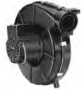
FIG. E A145