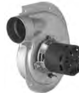
FIG. I A169