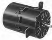
FIG. A D1167