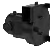
FIG. N A175