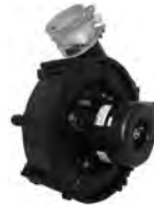
FIG. C A067