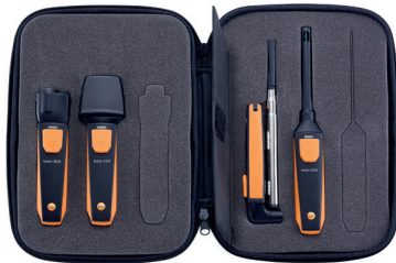
VAC Smart Probe Kit: 0563 0003